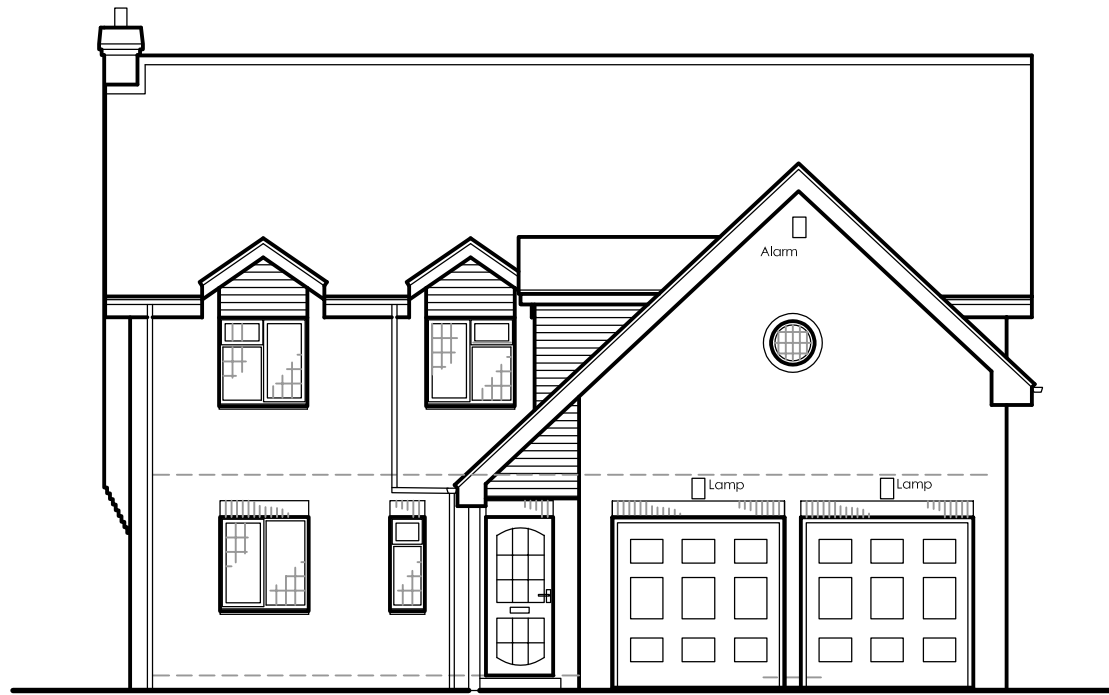
Existing Front Elevation From the East

Do not scale from this drawing The Contractor is to check all dimensions on site and report discrepancies to the designer. All rights described in Chapter IV of the Copyright, Designs and Patents Act 1988 have been generally asserted. Michael Ragg Architecture & Design Limited Registered Company No. 08461070