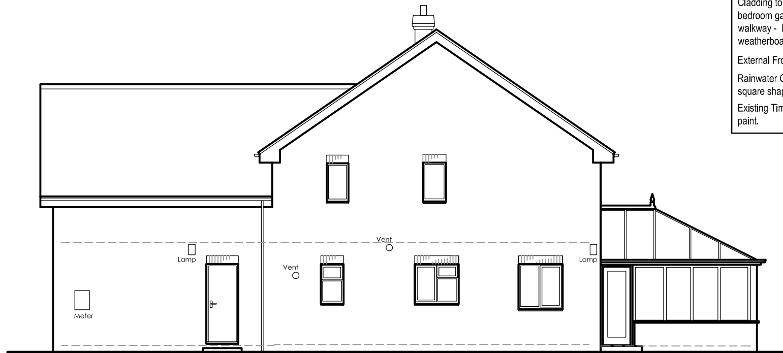
Existing Side Elevation From the North