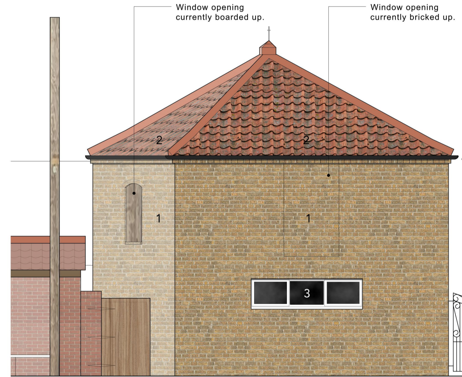
South Elevation 1:50 @ A1