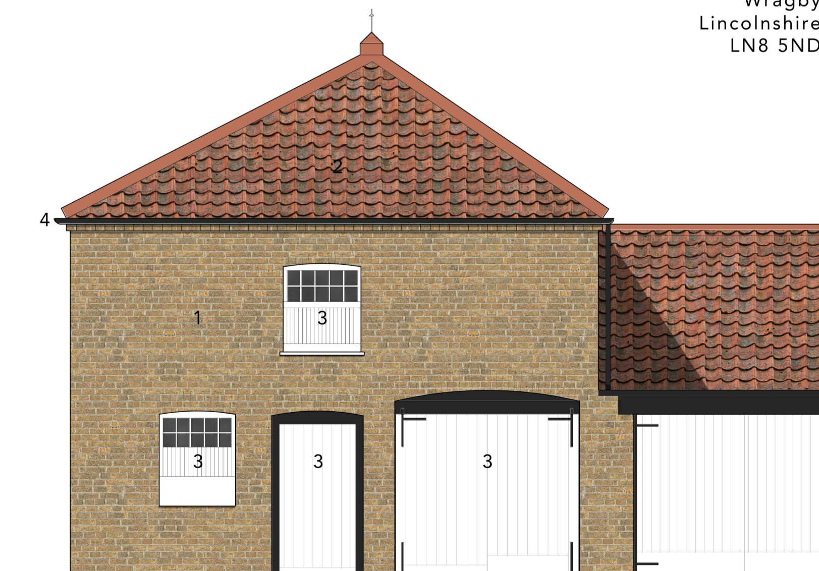
North East Elevation 1:50 @ A1