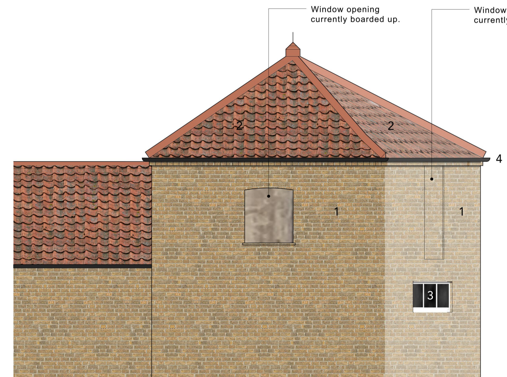
South West Elevation 1:50 @ A1