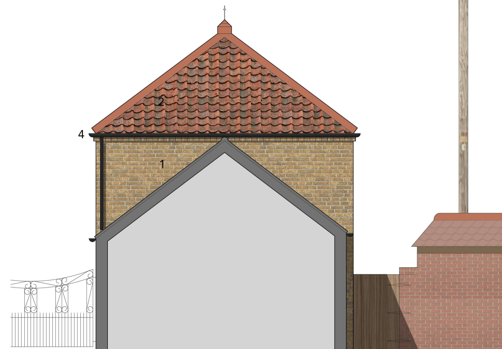
North West Elevation 1:50 @ A1