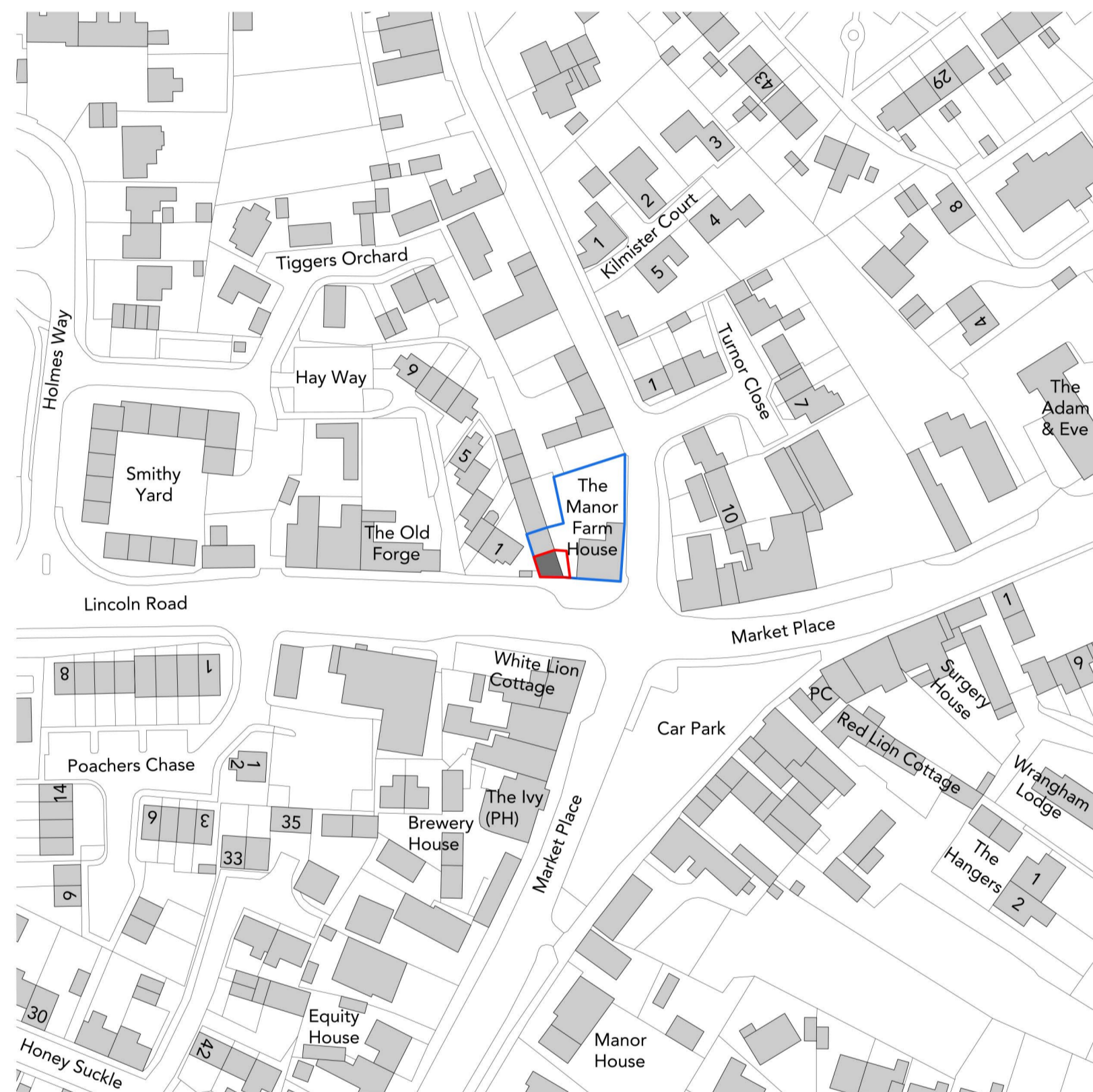
Location Plan 1:1250 @ A1