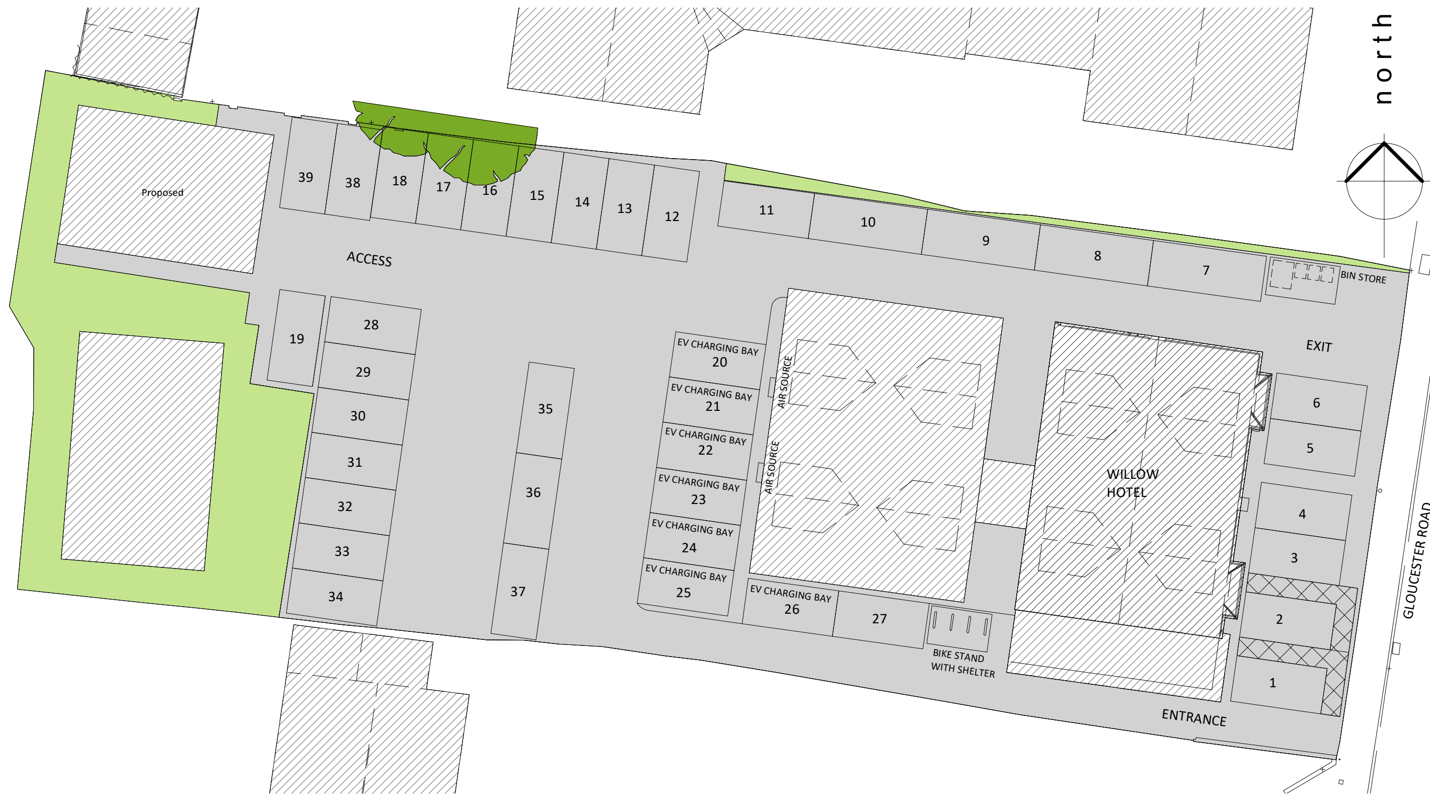
00_Proposed Site layout 1 : 200

RESPONSIBILITY IS NOT ACCEPTED FOR ERRORS MADE BY OTHERS FROM SCALING FROM THIS DRAWING. ALL CONSTRUCTION INFORMATION SHOULD BE TAKEN FROM FIGURED DIMENSIONS ONLY NOTE: ALL MEASUREMENTS AND SPANS TO BE CHECKED ON SITE AND CONFIRMED BEFORE FABRICATION AND WORK COMMENCES. THIS DRAWING SHOWS DESIGN INTENT ONLY FOR ALL STRUCTURAL COMPONENTS. STRUCTURAL ENGINEER TO SIZE/DESIGN ALL REQUIRED STRUCTURAL COMPONENTS AND PROVIDE CALCULATIONS FOR BUILDING CONTROL APPROVAL BEFORE WORK COMMENCES. STRUCTURAL ENGINEER AND SPECIALIST DESIGNERS TO CARRY OUT OWN SURVEY FOR STRUCTURAL COMPONENT SPANS AND SIZES / SPECIALIST DESIGNS. ALL RELEVANT STATUTORY NOTICES TO BE SENT TO LOCAL AUTHORITY BY BUILDER AT VARIOUS STAGES OF THE CONTRACT.