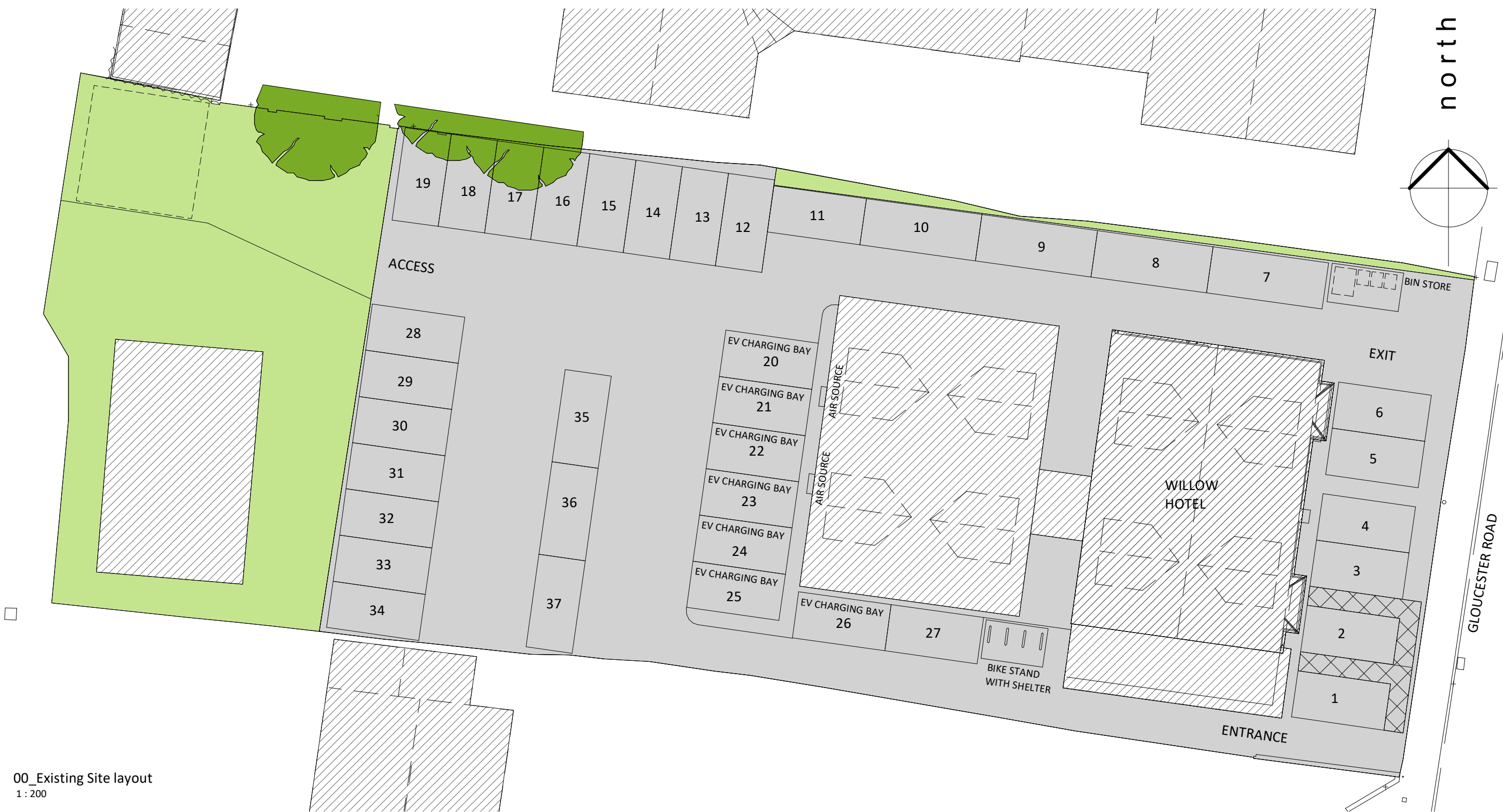
00_Existing Site layout 1 : 200