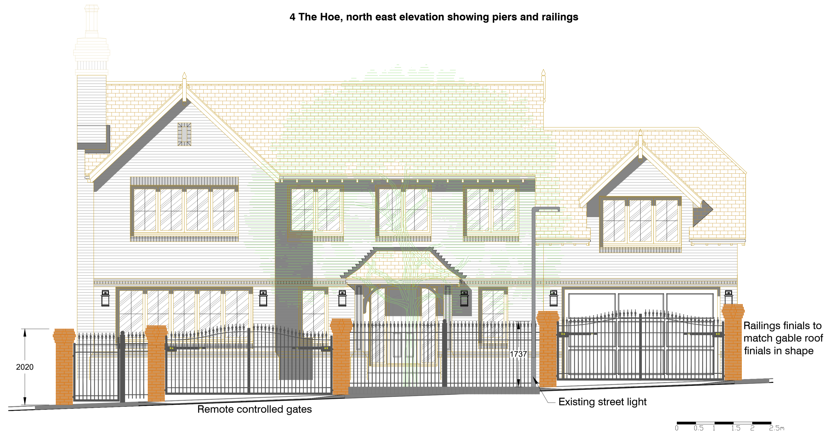
4 The Hoe, north east elevation showing piers and railings