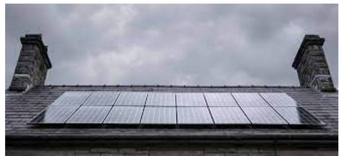
Above: Example of photovoltaic panels