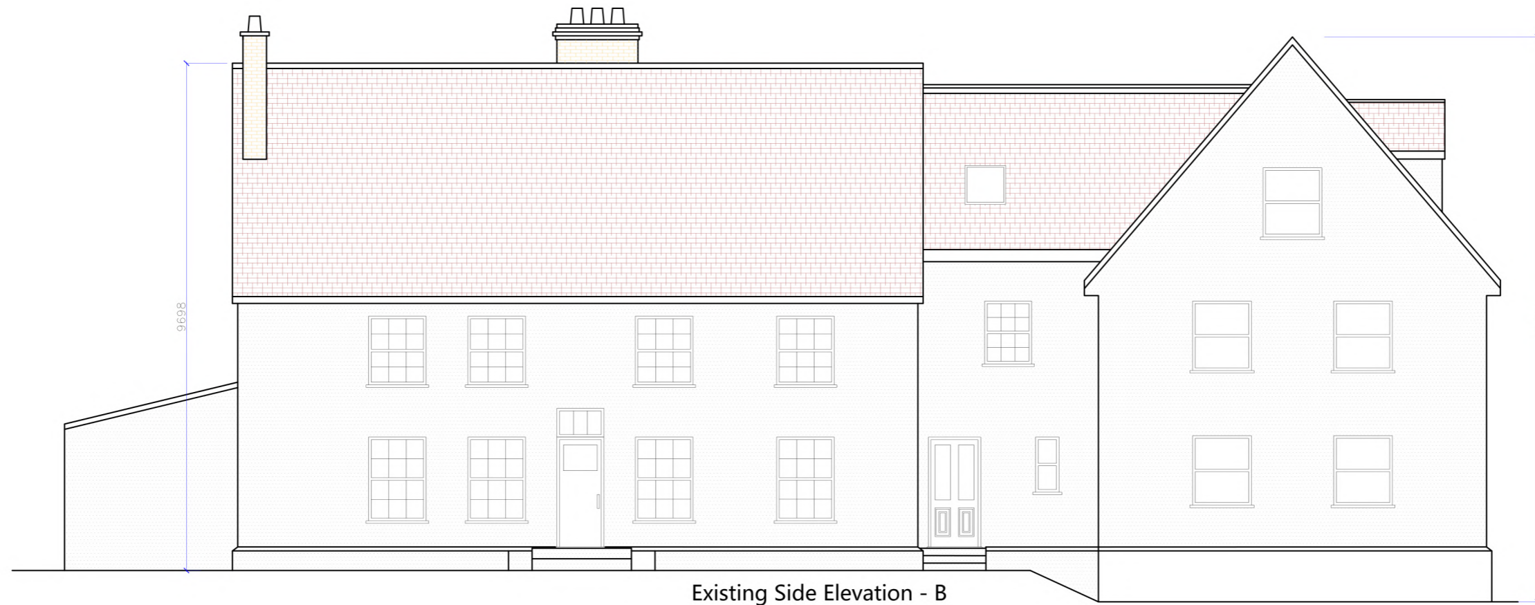
Existing Side Elevation - B