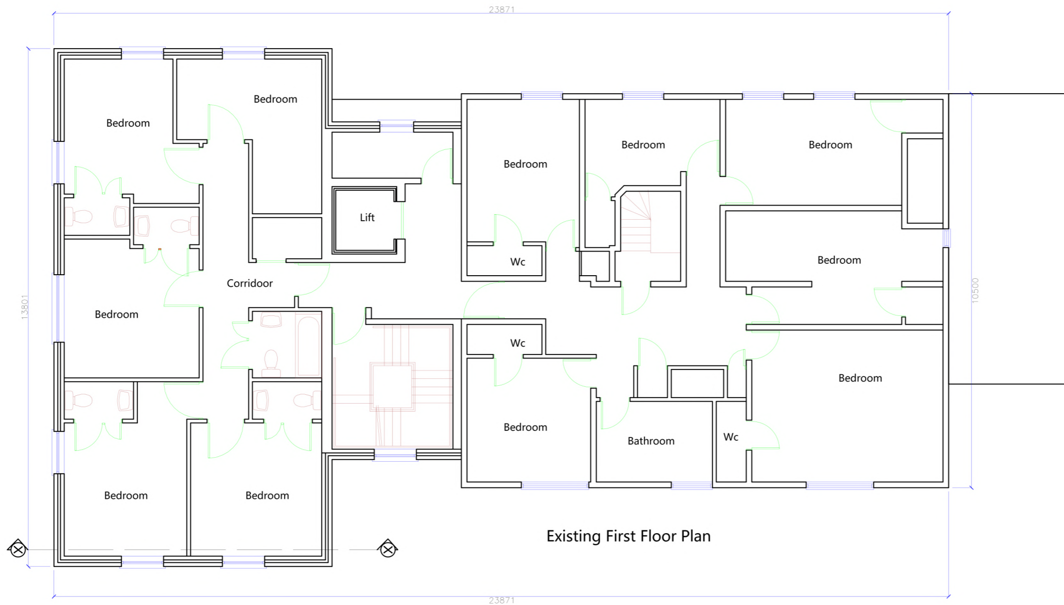
Existing First Floor Plan