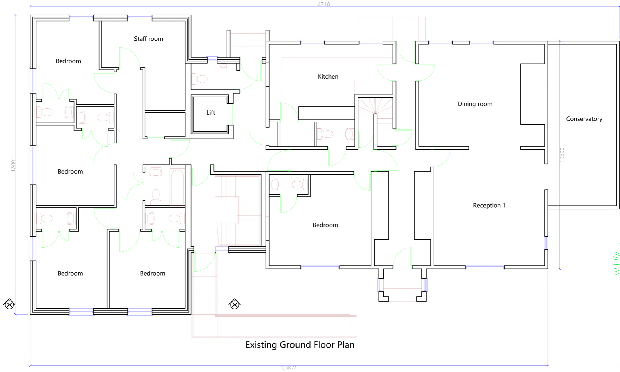
Existing Ground Floor Plan