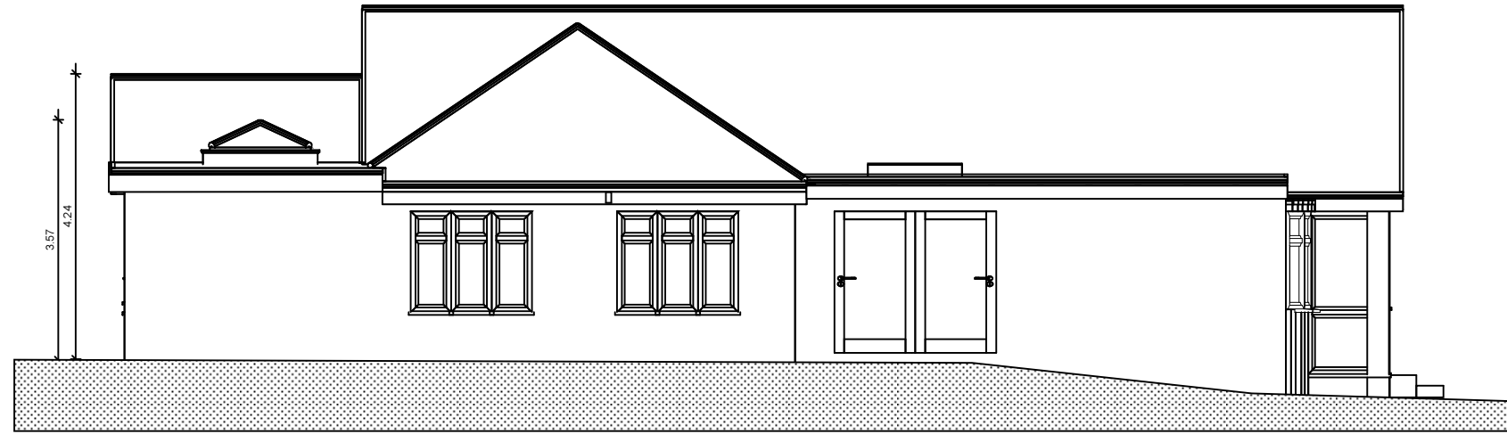
Proposed West Facing Side Elevation