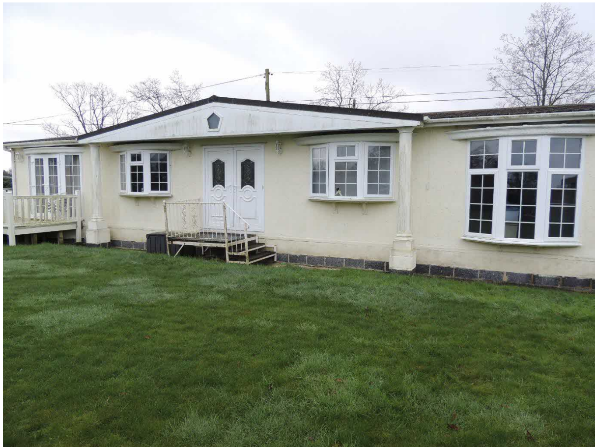
Photo 1: Front (northern) elevation. The proposal is for a new dwelling to be erected at the site

As part of a planning proposal involving The Twiggery, Chapel Road, Beaumont-cum-Moze, Essex CO16 0AR, a site visit was conducted on 22 nd February 2024 to determine whether the site had the potential to be occupied by protected species, which would be affected if any proposed development were to go ahead.