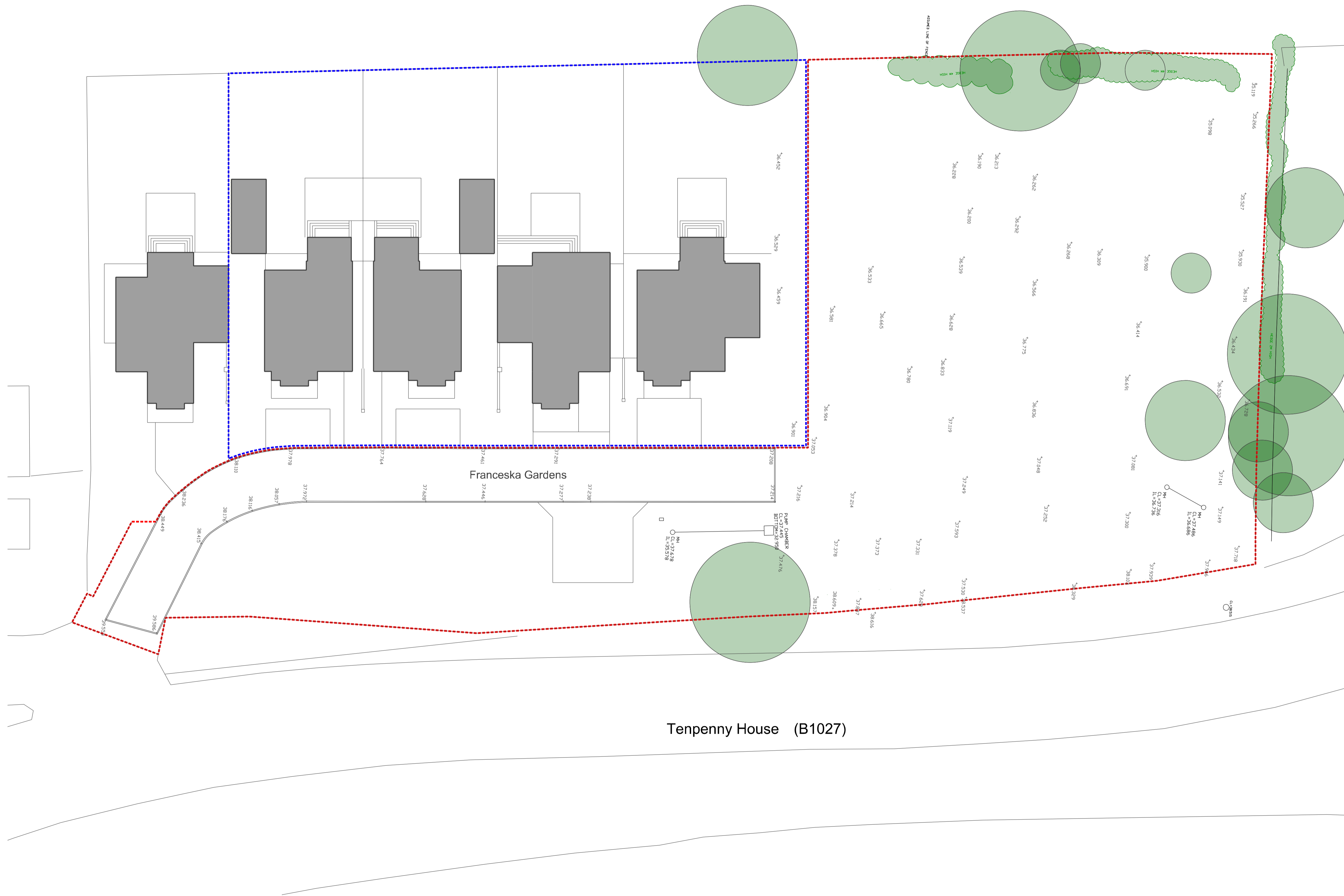
Existing Site Plan - Topo Survey (scale 1:200 @ A1)