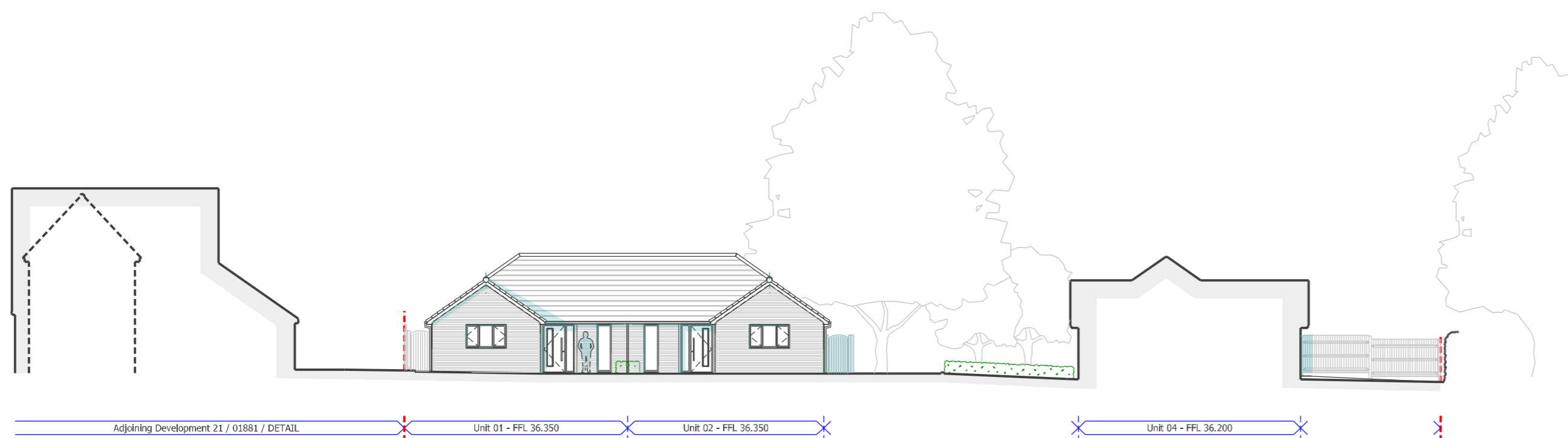
Proposed Street Scene / Section 1 (scale 1:200 @ A2)