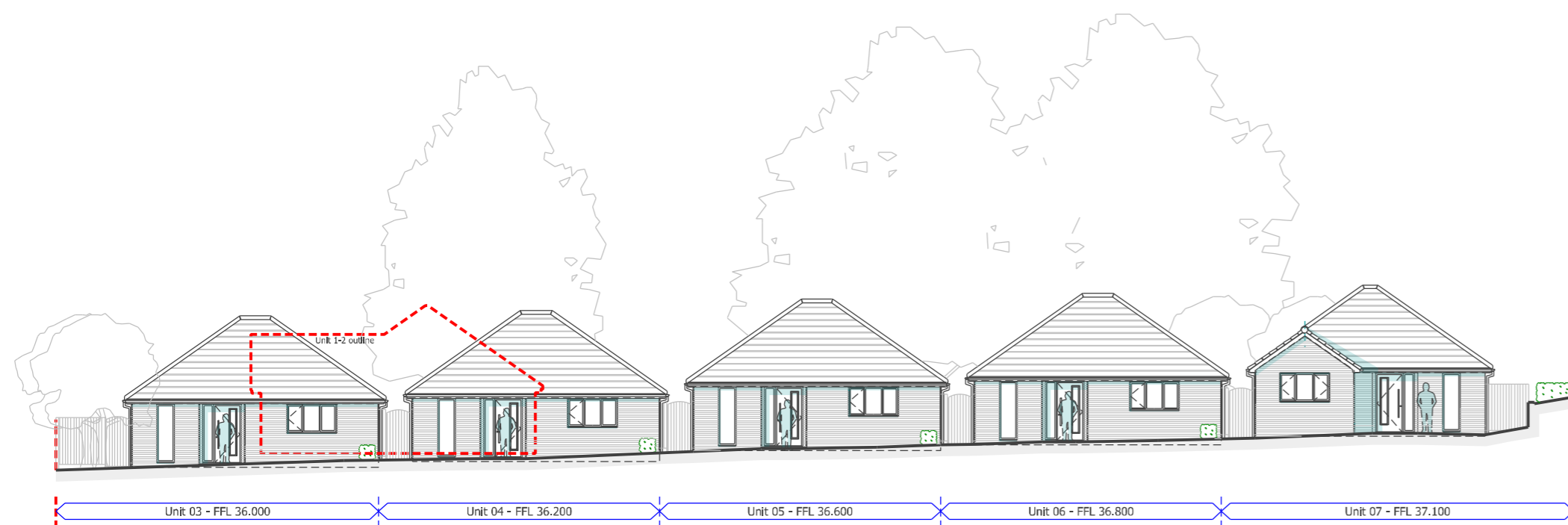
Proposed Street Scene / Section 2 (scale 1:200 @ A2)