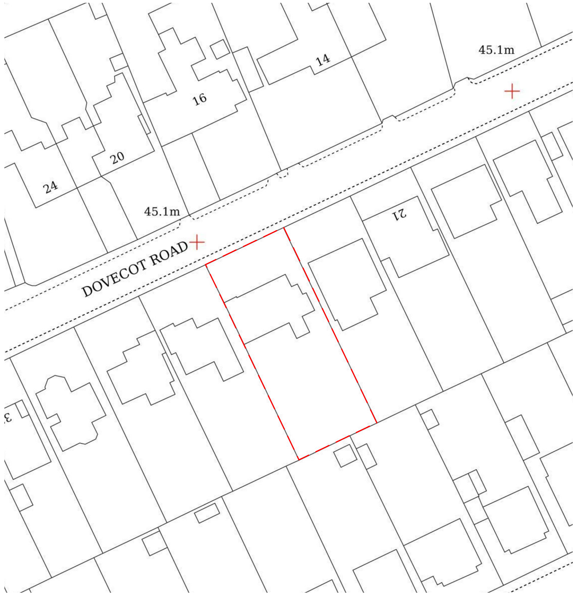
BLOCK PLAN. SCALE 1:500 @ A3