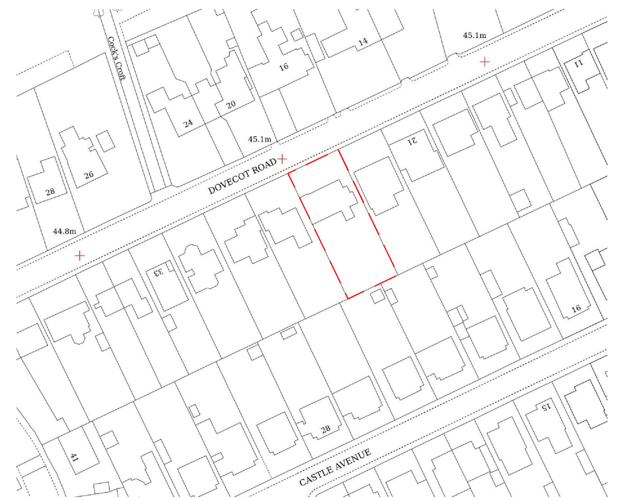
LOCATION PLAN. SCALE 1:1250 @ A3