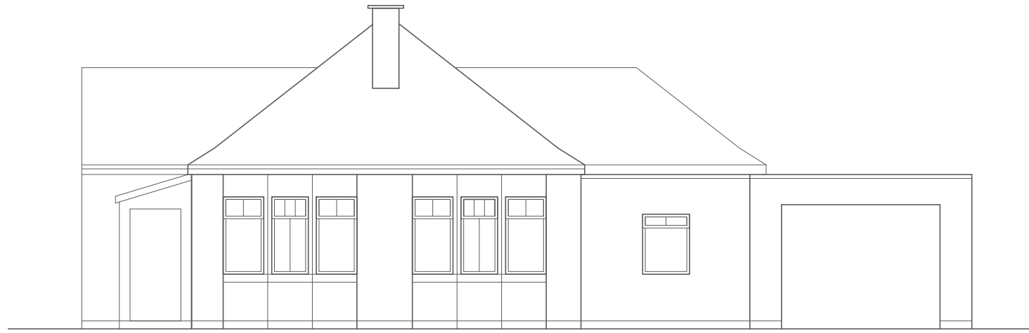
Front (North) Elevation