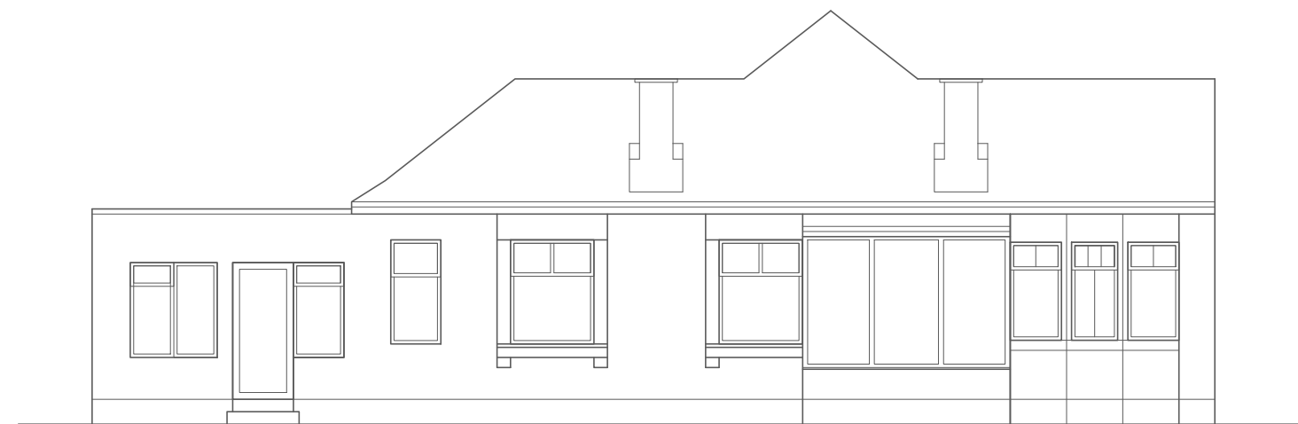
Rear (South) Elevation