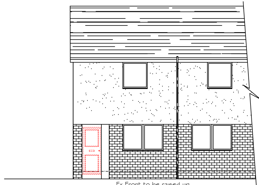
Ex Front to be raised up to be same lvl of Ex Grd Floor Lvl. Existing Front Elevation Scale 1:100