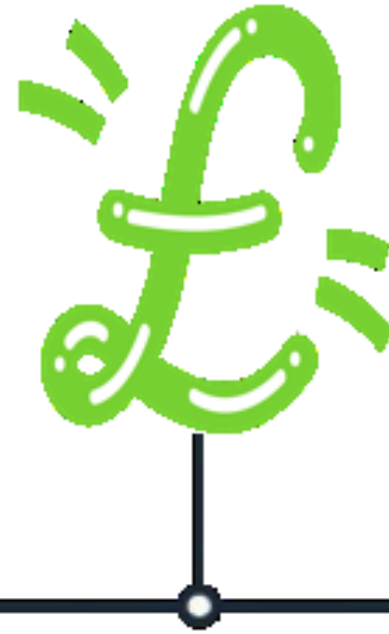
SEG Get paid for export