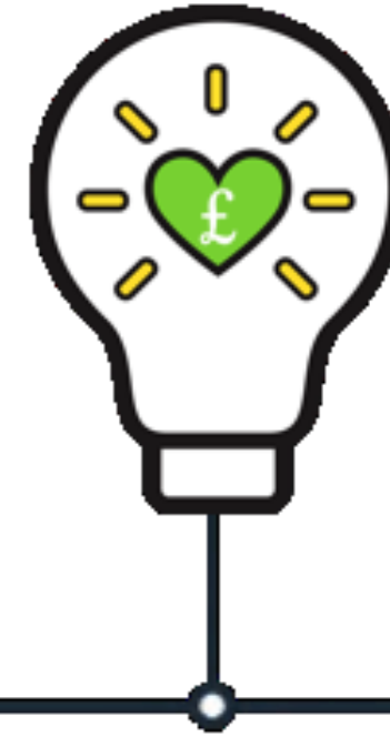
Octopus - Buy Cheap Clean Energy