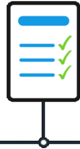
Lower Bills For 25-Years