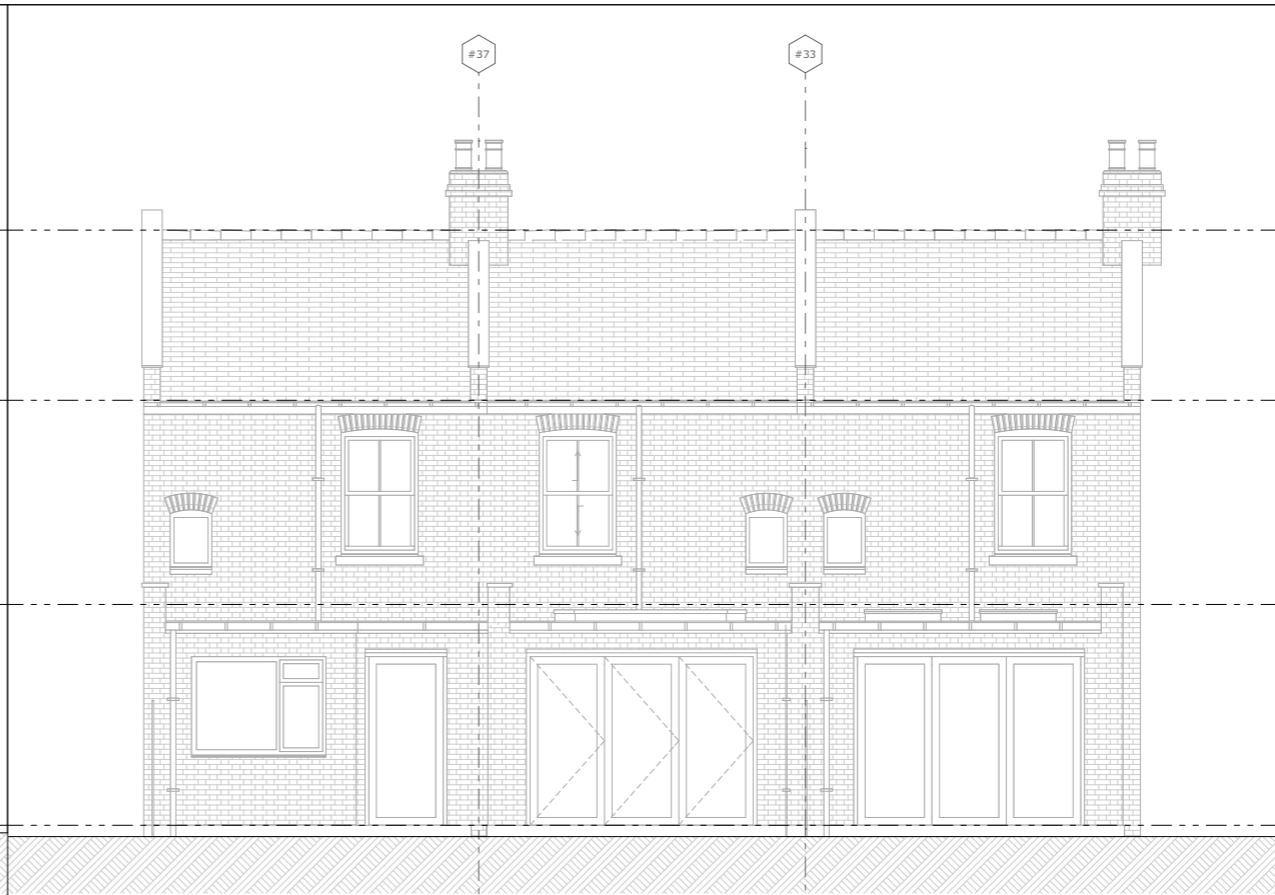
Elevation B (Rear) - Existing