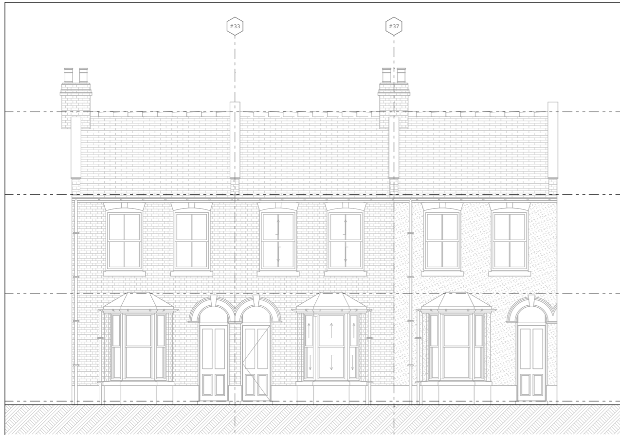
Elevation A (Front) - Existing