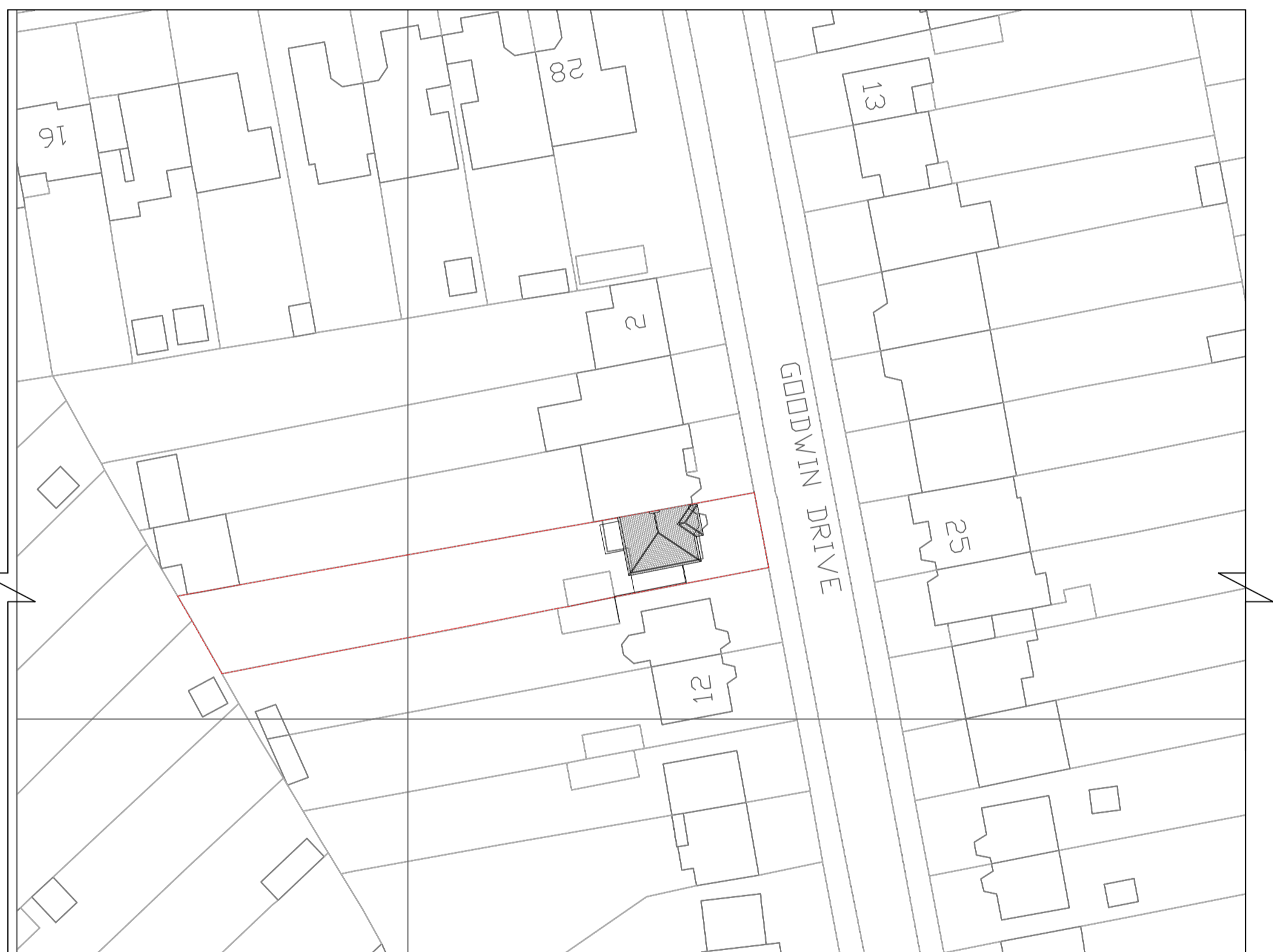
Existing Block Plan Scale 1:500

234 Green Lane, London, SE9 3TL +44 (0)208 064 22 50 info@khdarchitecture.com