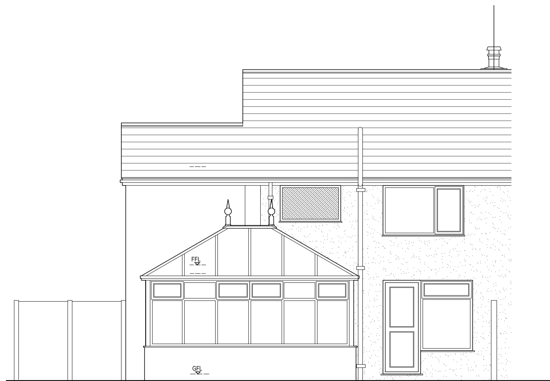
REAR ELEVATION SCALE 1:50