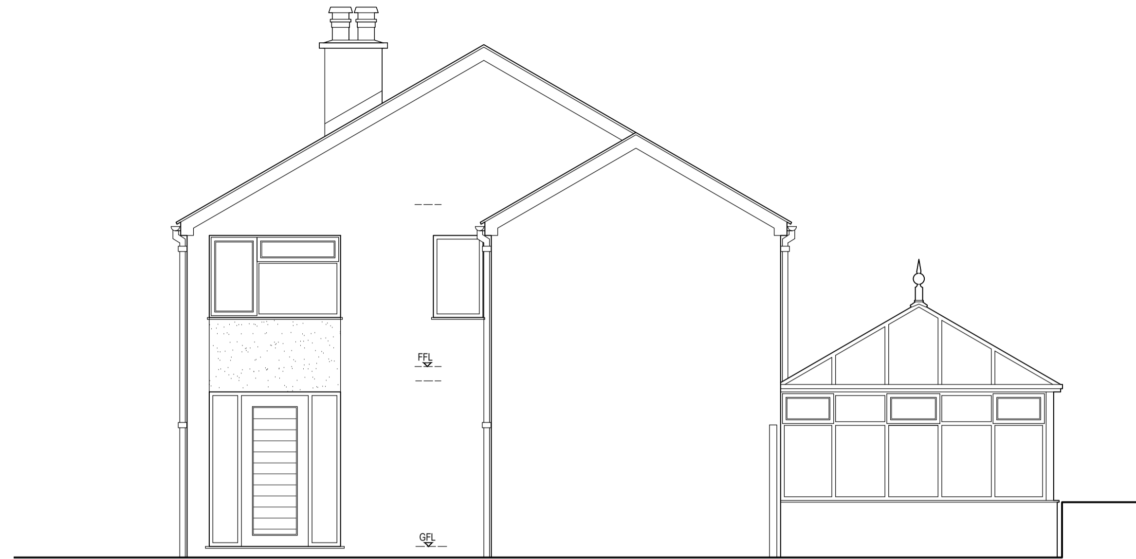
SIDE ELEVATION SCALE 1:50