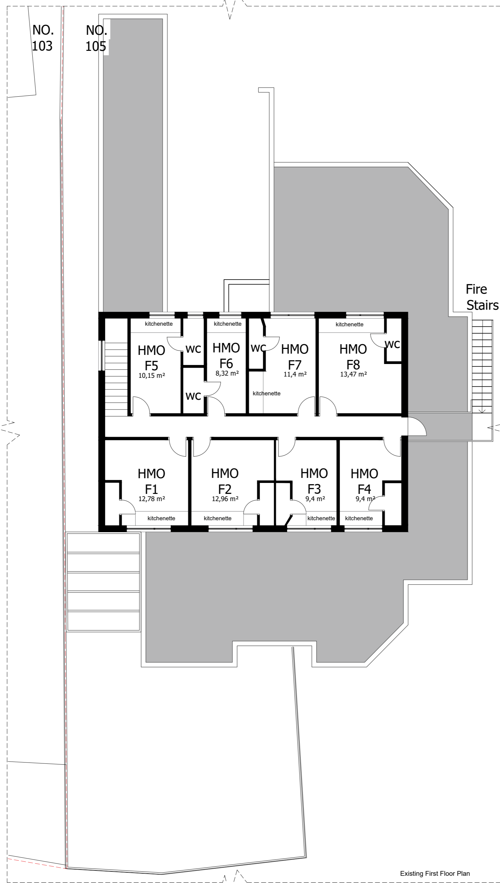
Existing First Floor Plan