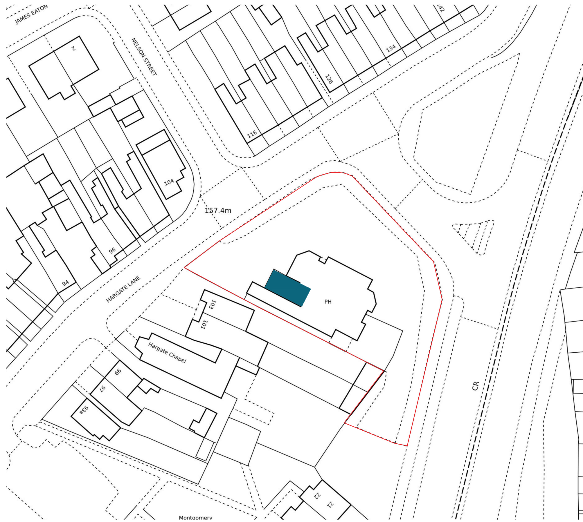
Proposed Block Plan( No Proposed Change )

Any dimensions shown should be checked on site and discrepancies reported to the Architect prior to construction. Designs are not coordinated with engineer projects. Do not scale for construction purposes.