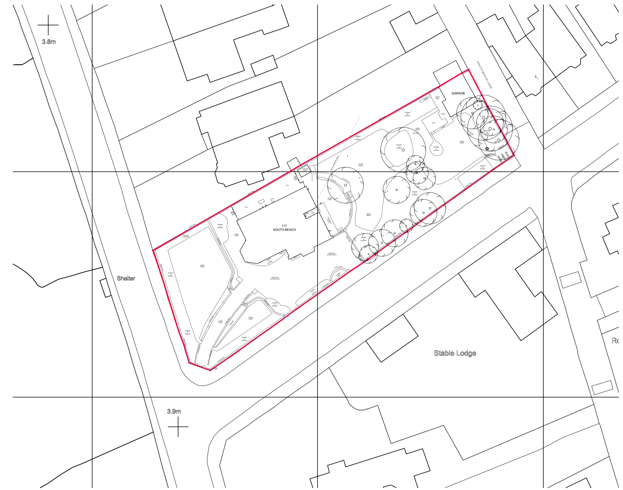
Site Plan 1 : 500