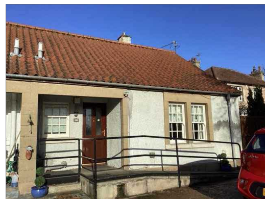
North Elevation As Existing