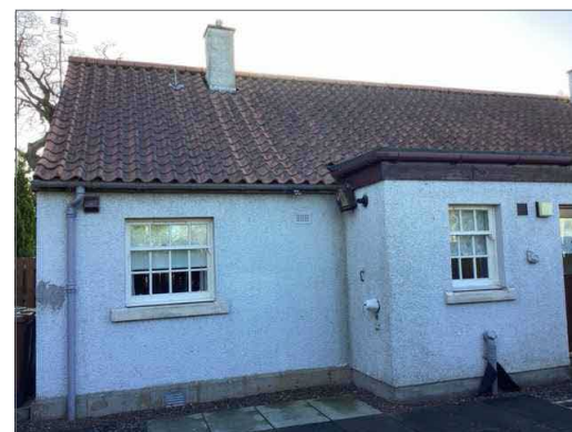
South Elevation As Existing