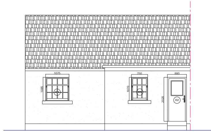
North Elevation As Existing Scale 1:100