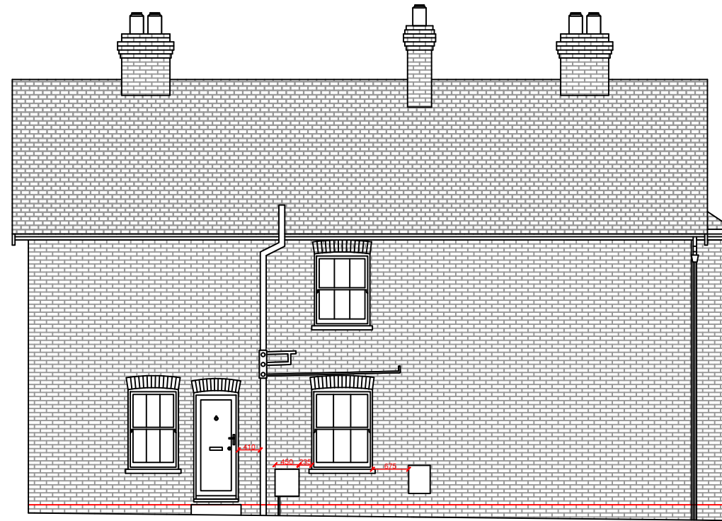
EXISTING SIDE ELEVATION 1