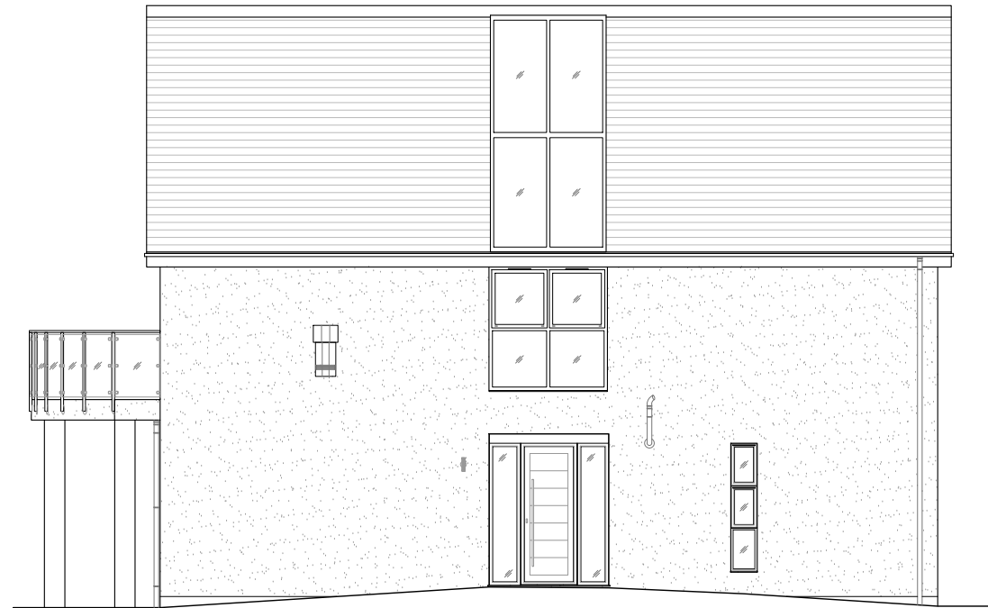
Right Side Elevation As Existing