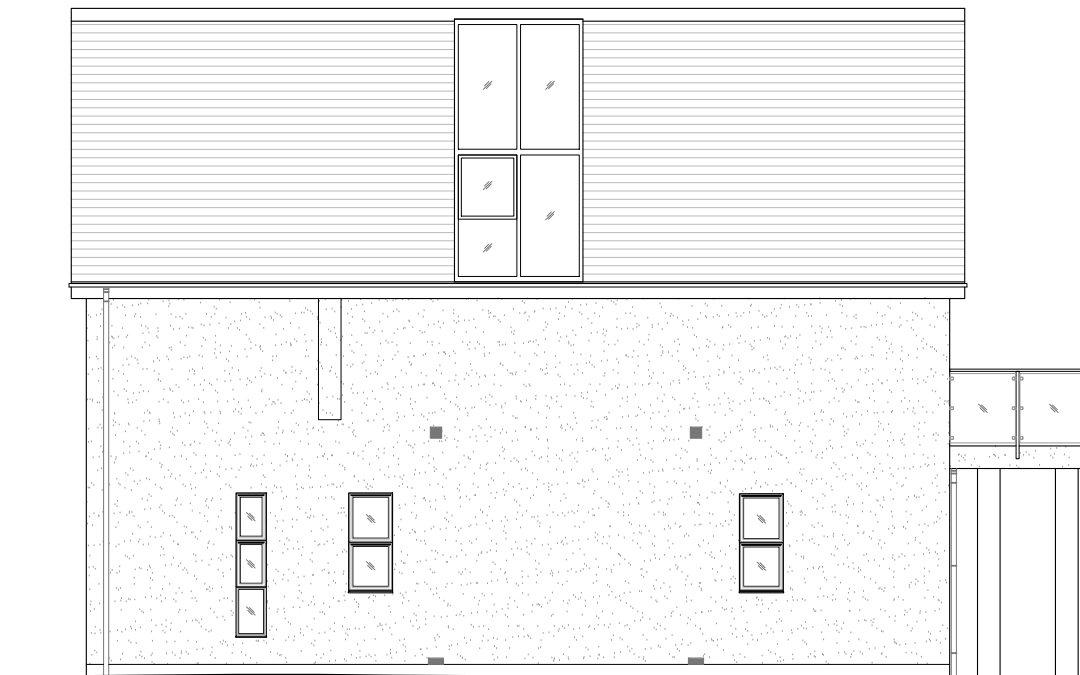
Left Side Elevation As Existing