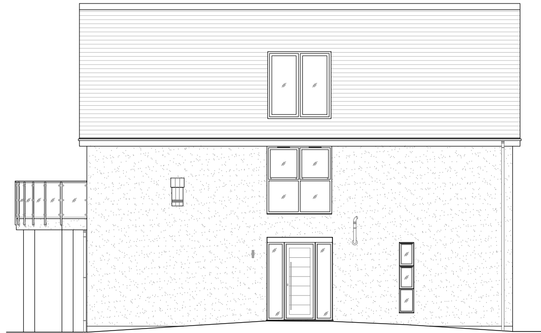
Right Side Elevation As Proposed