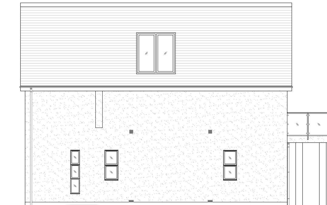
Left Side Elevation As Proposed