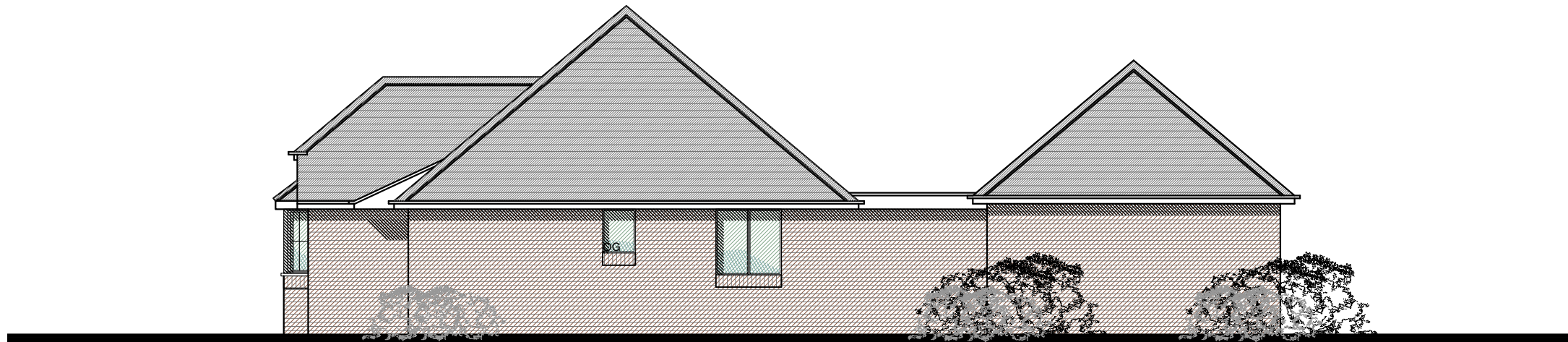
PROPOSED SIDE (NORTH) ELEVATION SCALE 1:100@A3