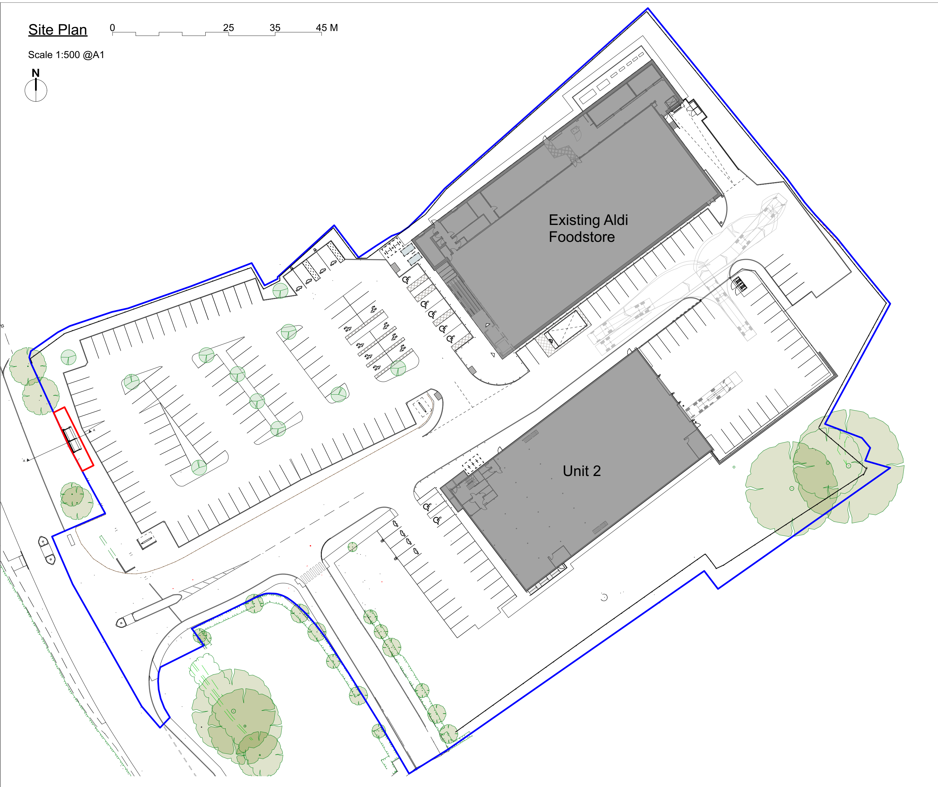
Site Plan 0 25 35 45 M Scale 1:500 @A1 N