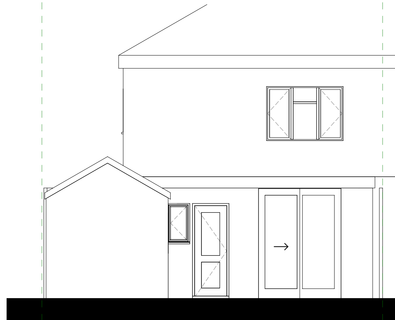
3 Existing Rear Elevation Garage 1 : 50