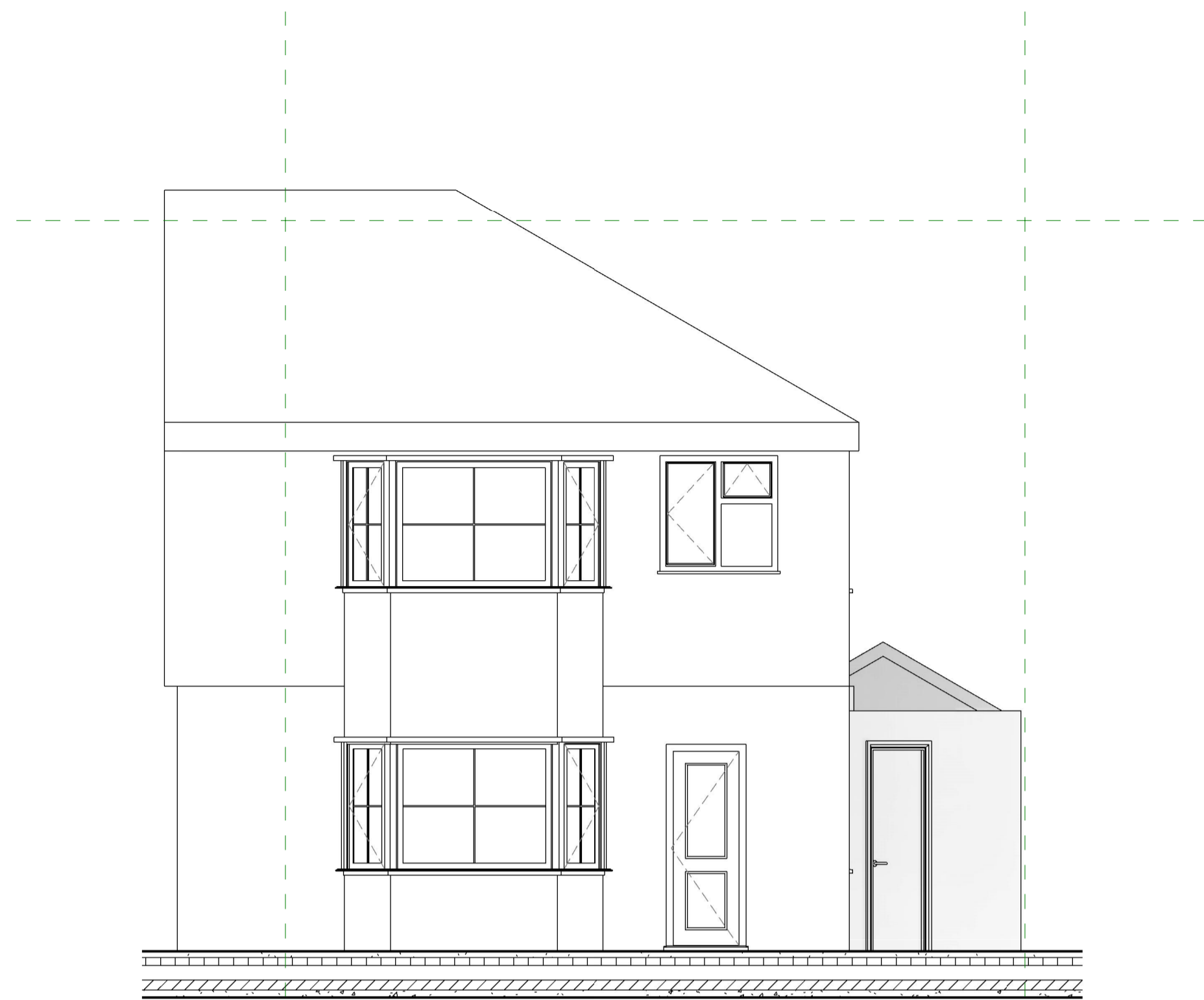
1 Front Elevation 1 : 50