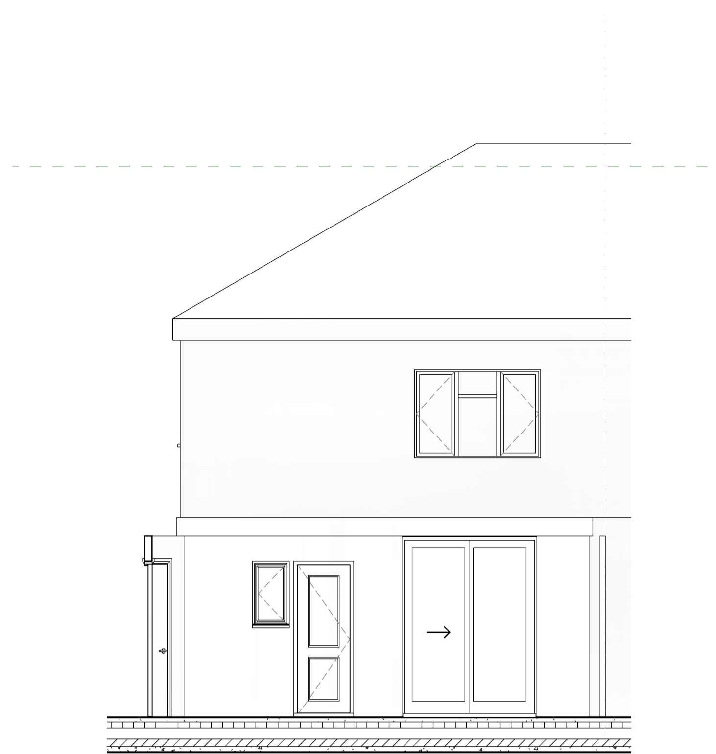
3 Rear Elevation 1 : 50