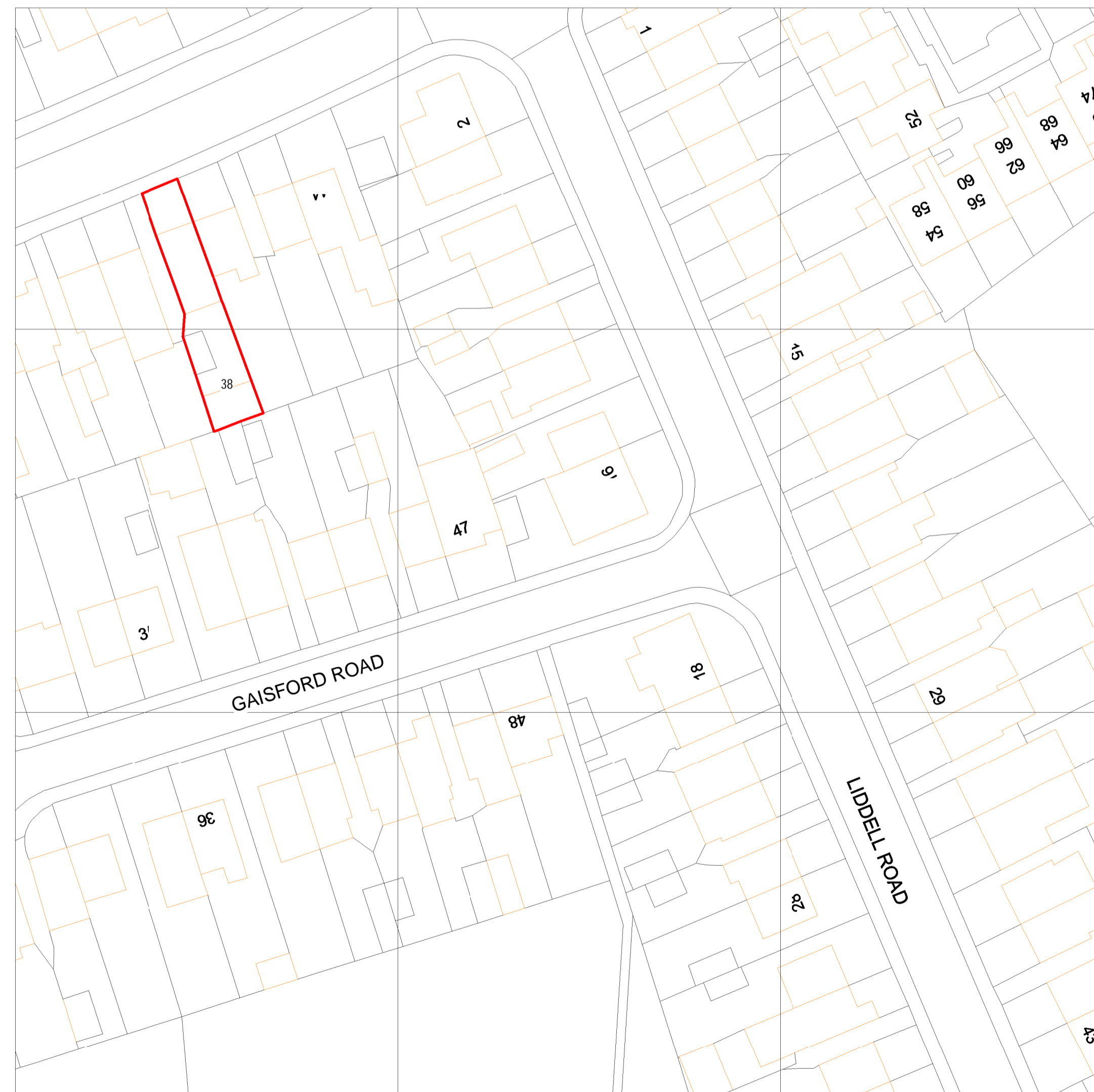
2 Existing Block Plan 1 : 500