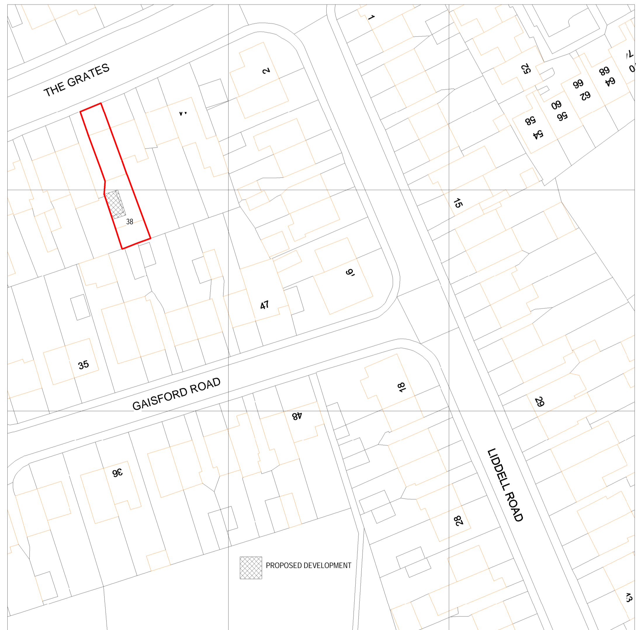
3 X-Proposed Block Plan 1 : 500