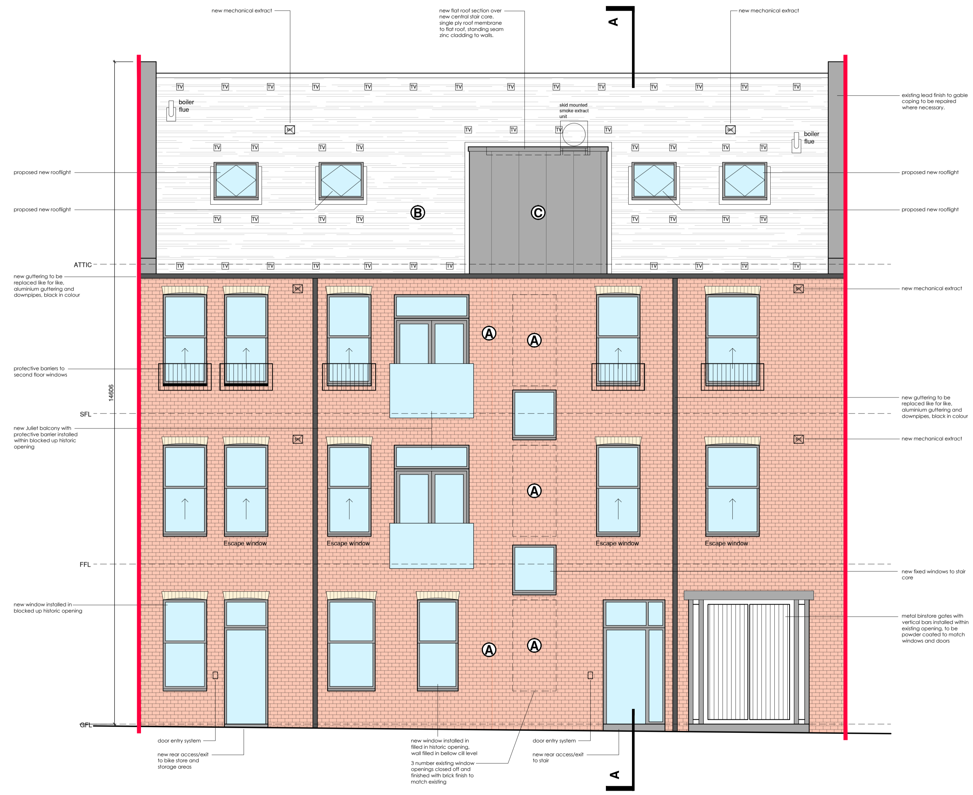
1.) FRONT ELEVATION (SANDYFORD PLACE LANE) SCALE 1/50 1:50 0 1 2 3 5 m 100 mm

This drawing is solely for the purposes of obtaining planning/building warrant approval. The drawing may be suitable for constructional purposes but it may be necessary to augment and/or amend this information for this purpose. No liability will be accepted for any omission on this drawing should the drawing be used for constructional purposes. This drawing, its contents and all information contained therein is protected by copyright. This drawing is for preliminary or planning purposes only unless specifically noted otherwise below, and does not constitute a construction issue drawing.