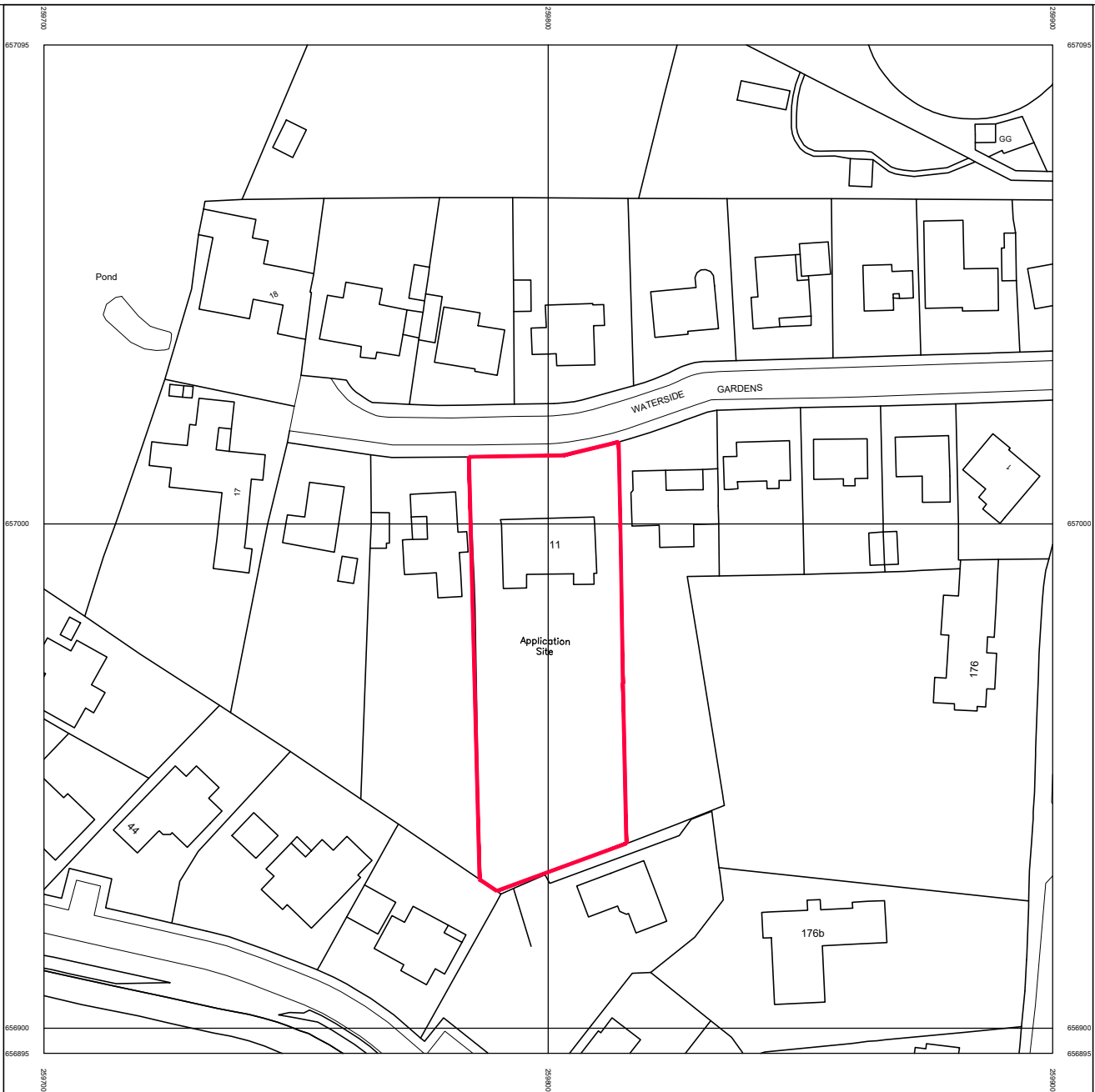
Location Plan as Existing @ 1:1250