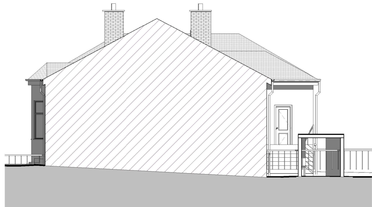
Existing Gable Elevation (Party Wall)