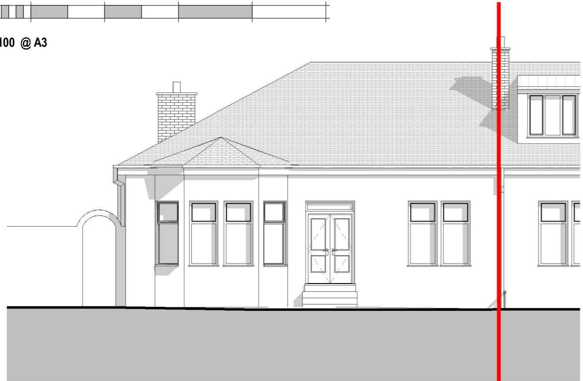
Existing Front Elevation (Fairfax Avenue)