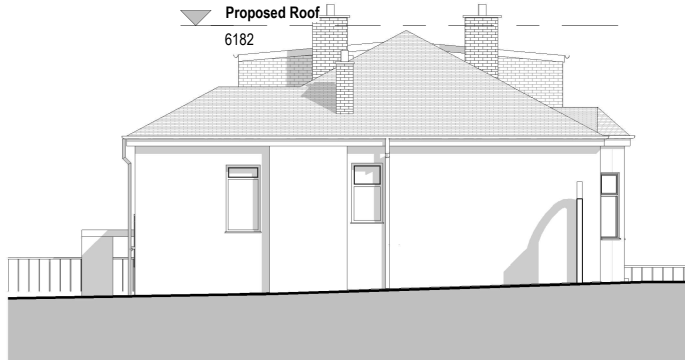
Existing Gable Elevation