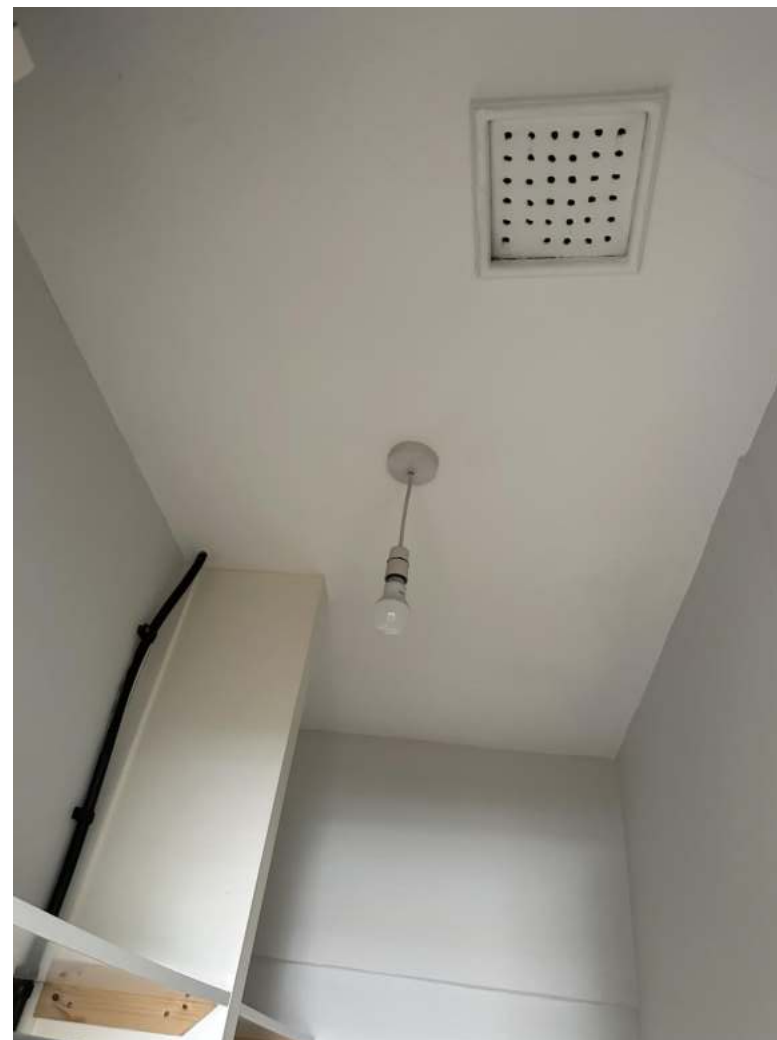
Wardrobe - Photo 2