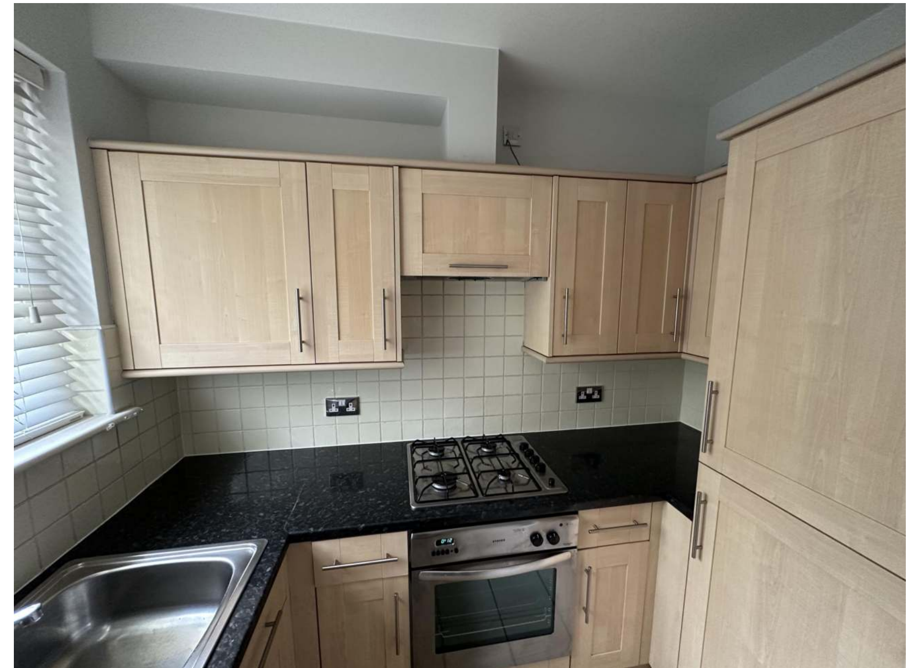
Kitchen - Elevation 3