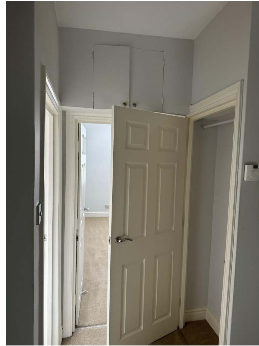
Entrance - Elevation 3