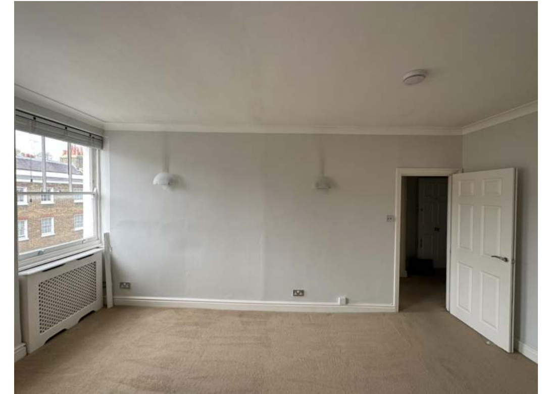
Reception Room - Elevation 4