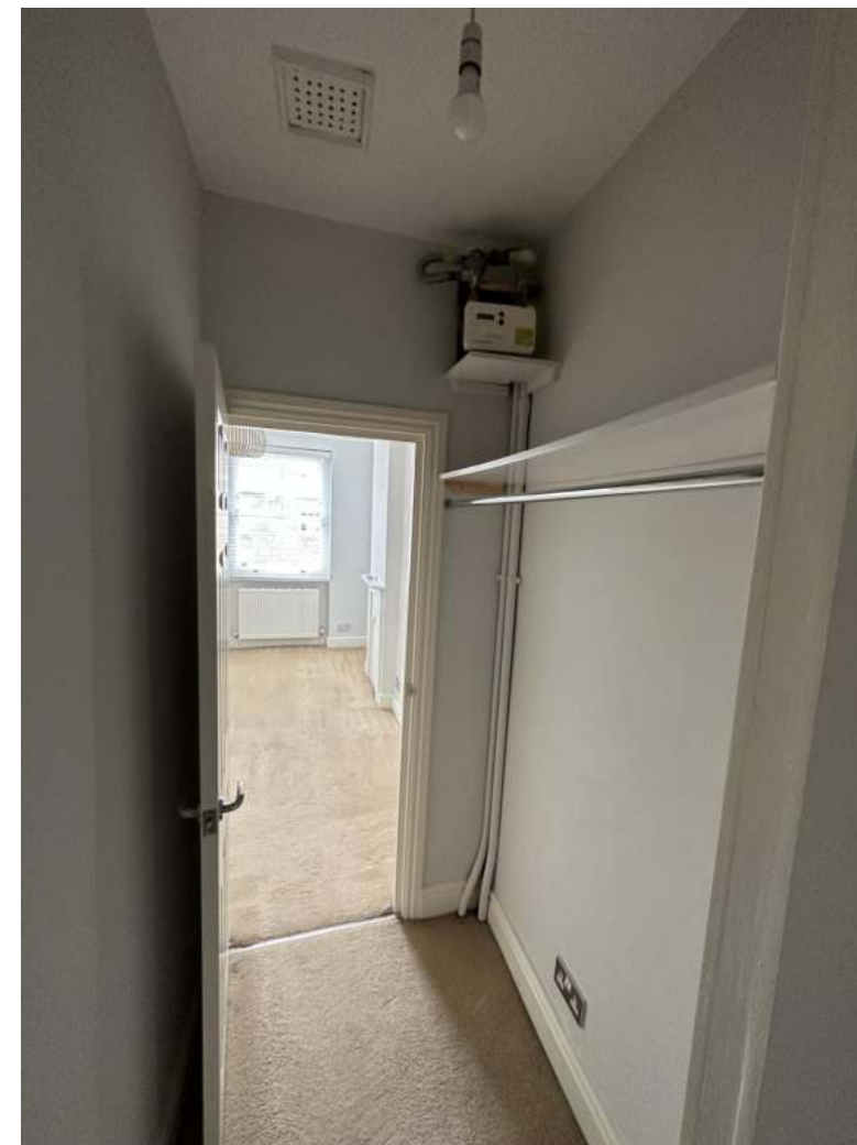
Wardrobe - Photo 3