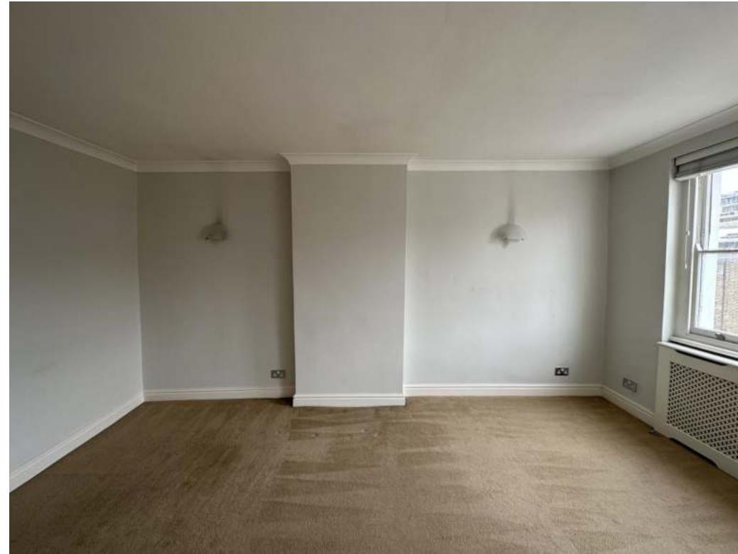
Reception Room - Elevation 2