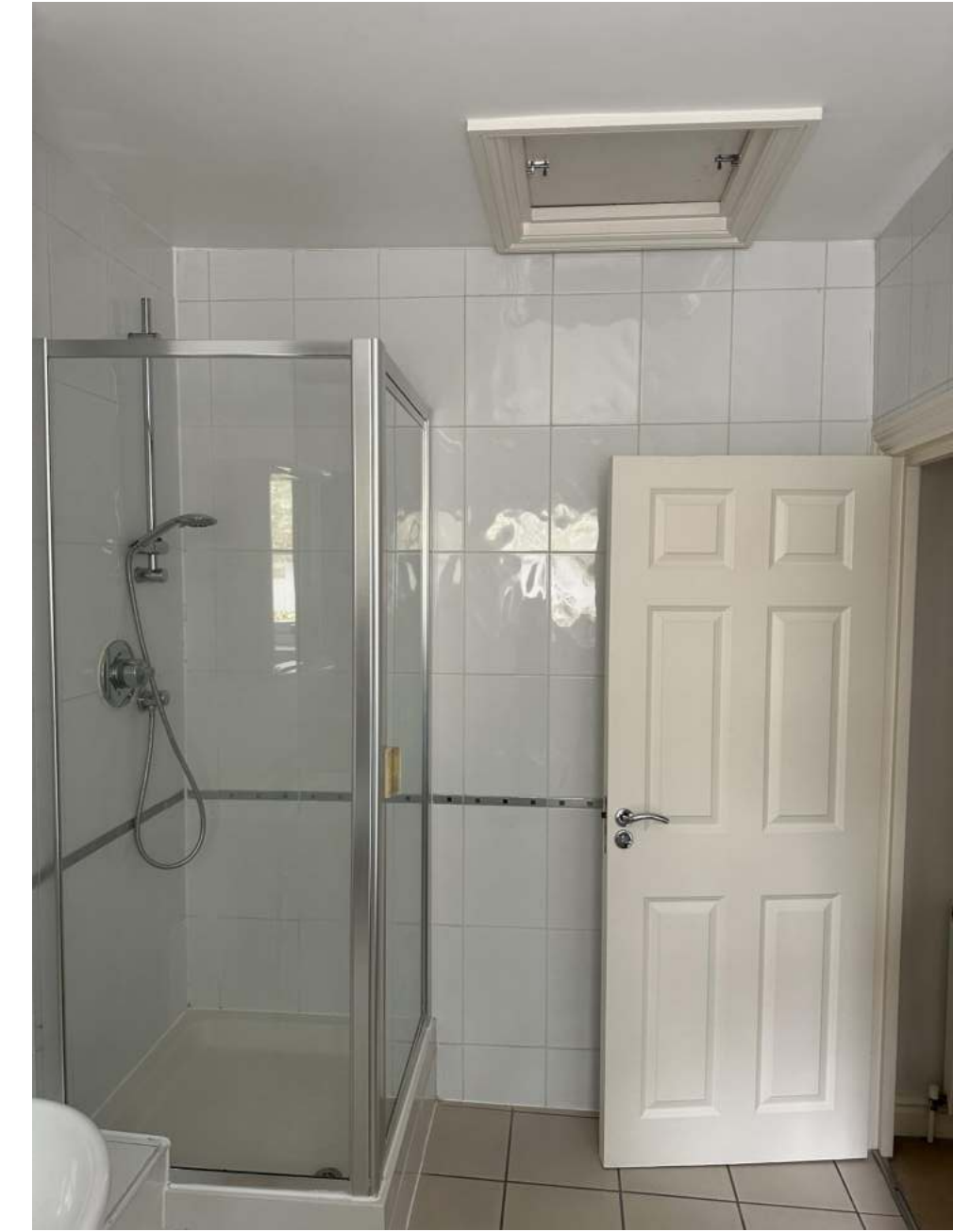
Bathroom - Elevation 4