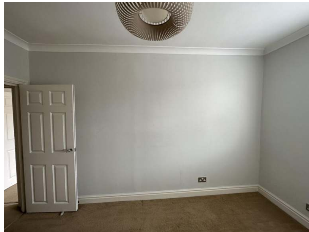
Bedroom - Elevation 2