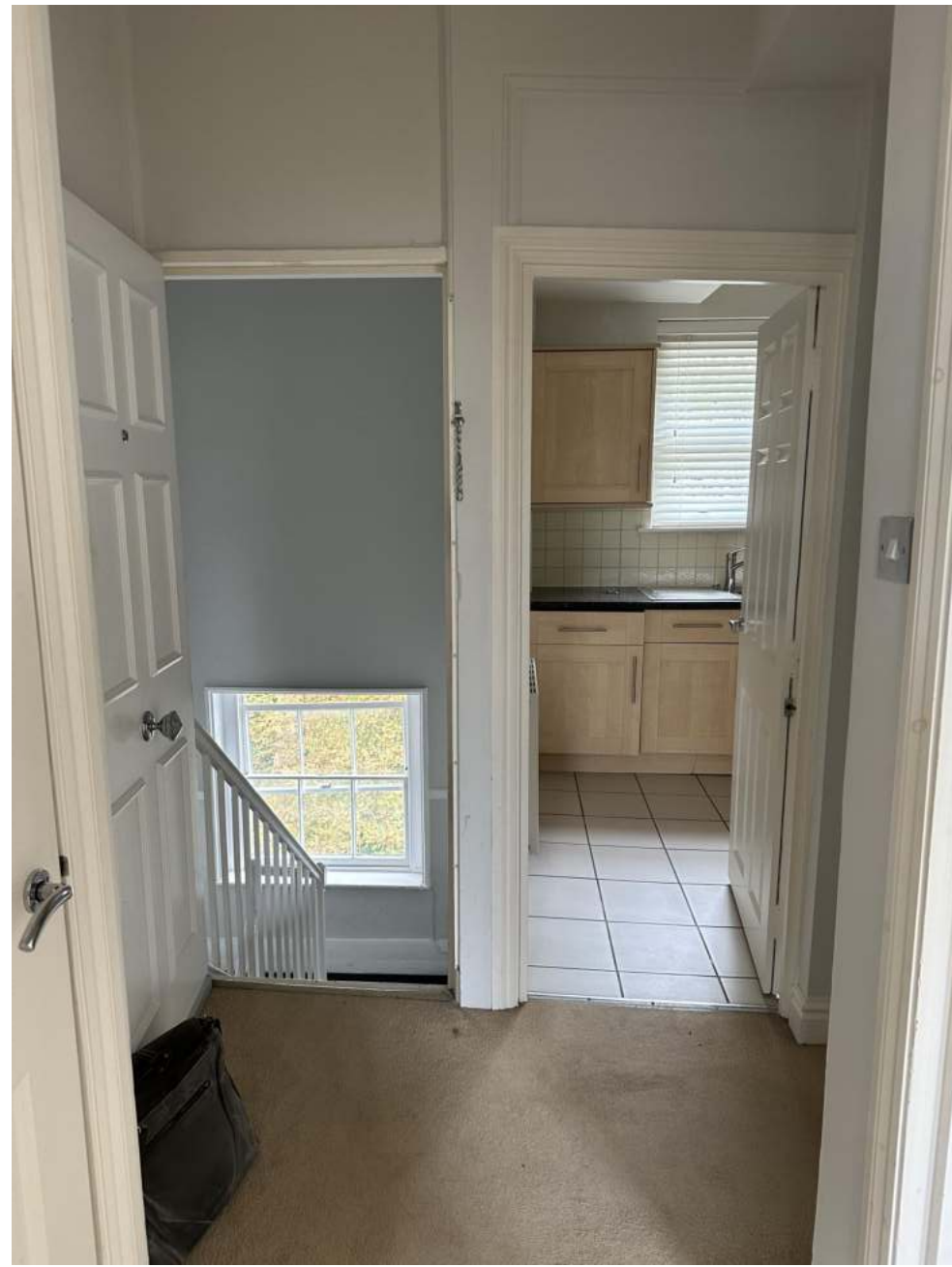
Entrance - Elevation 1