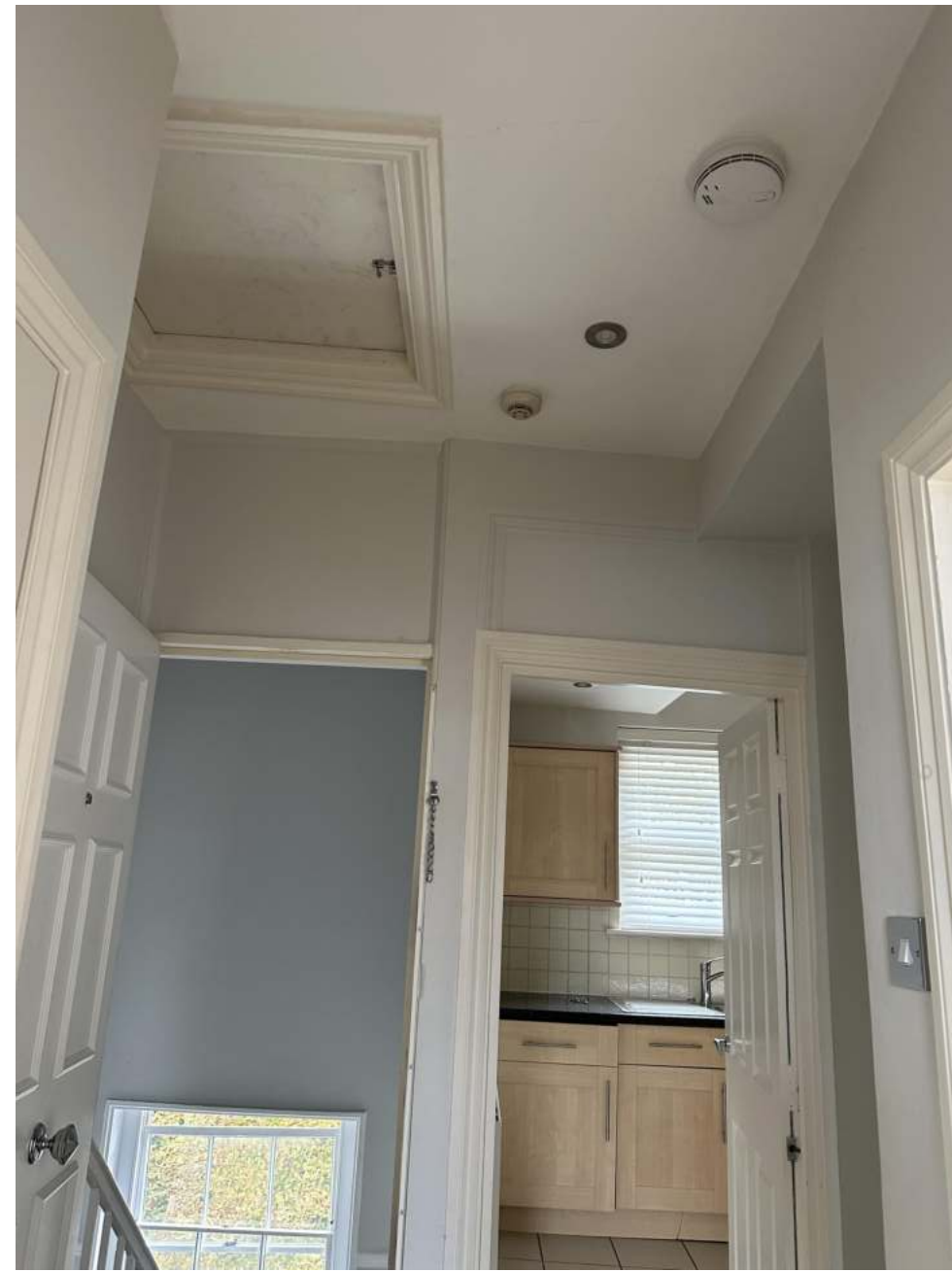
Entrance - Elevation 2