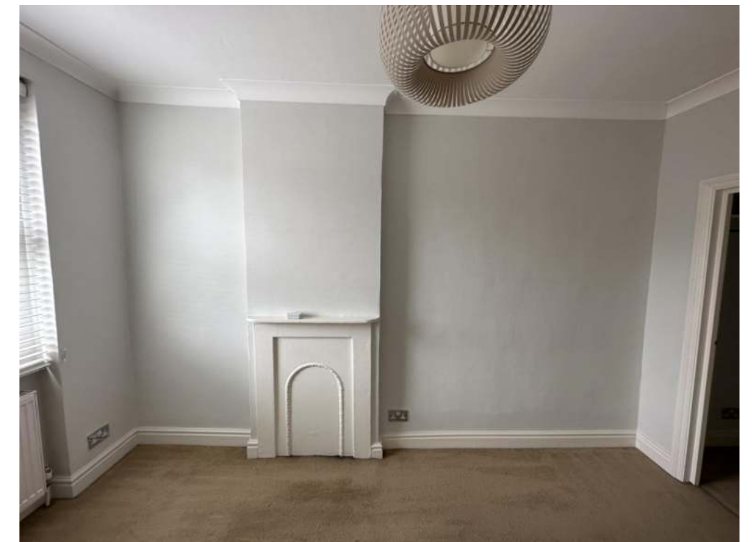
Bedroom - Elevation 4