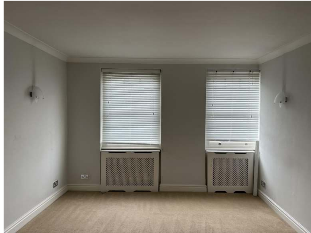
Reception Room - Elevation 1