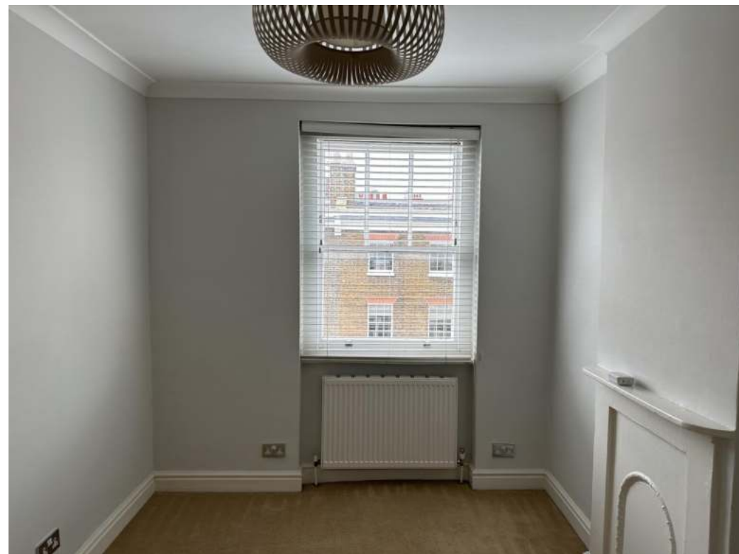
Bedroom - Elevation 1