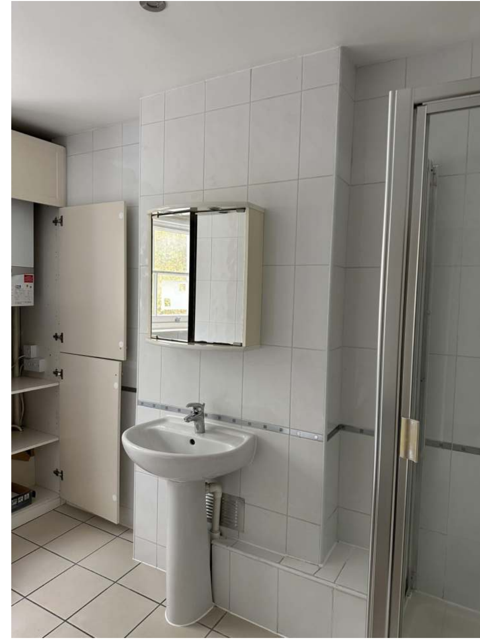
Bathroom - Elevation 3