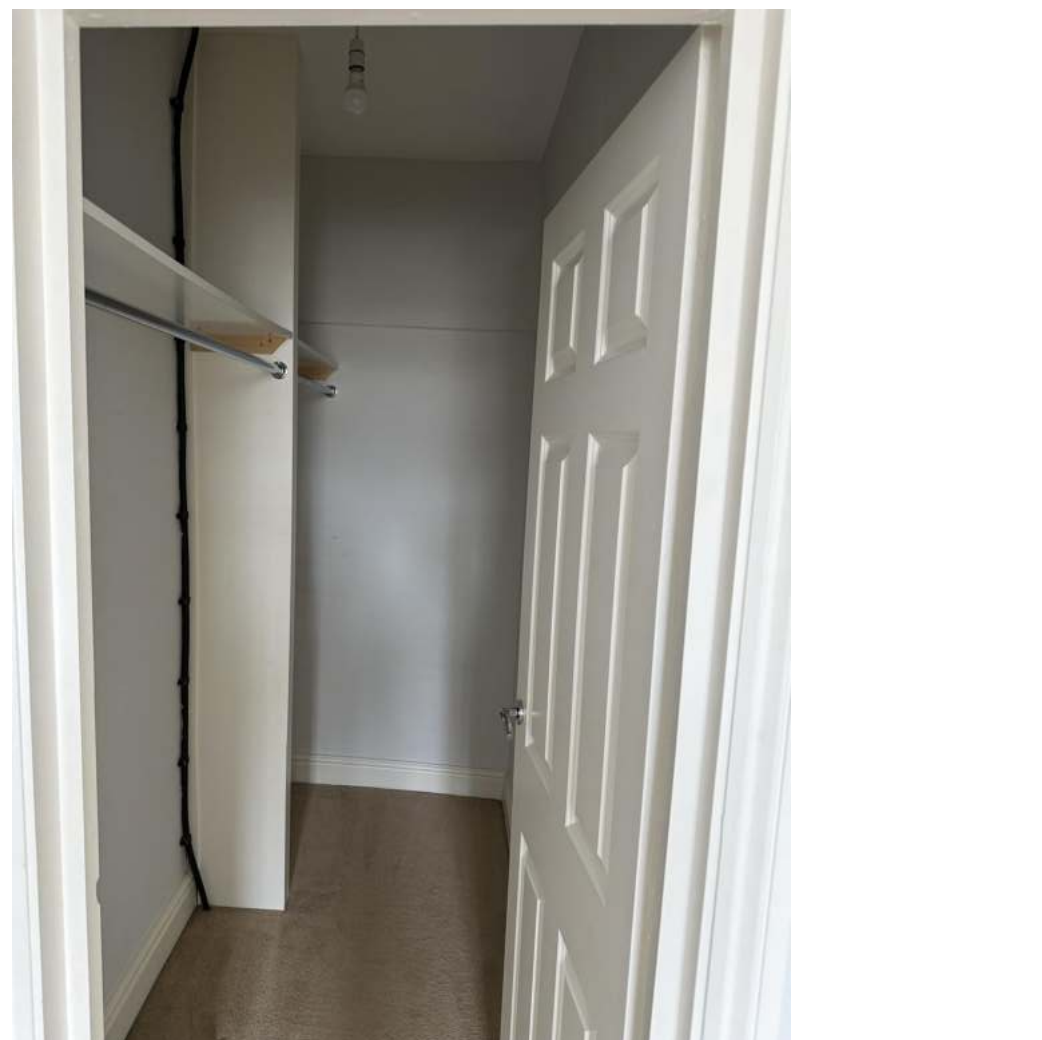
Wardrobe - Photo 1