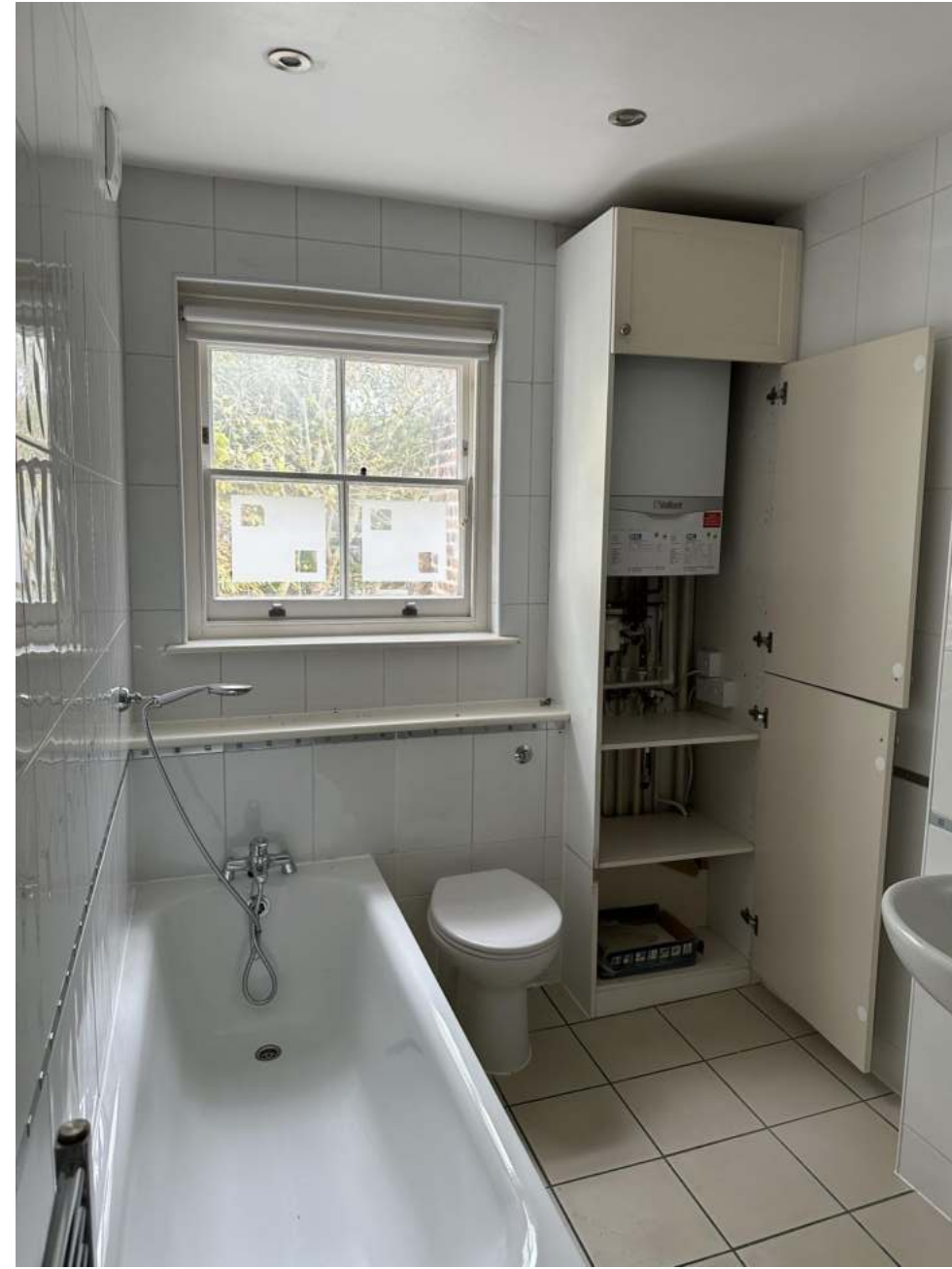
Bathroom - Elevation 2