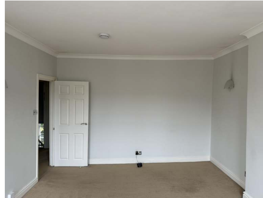
Reception Room - Elevation 3