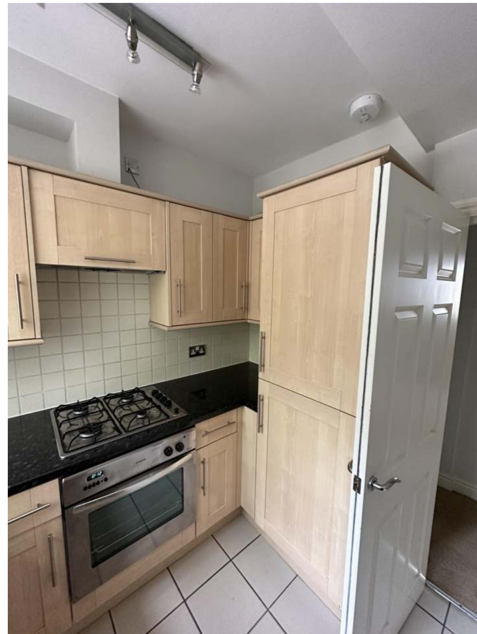
Kitchen - Elevation 2