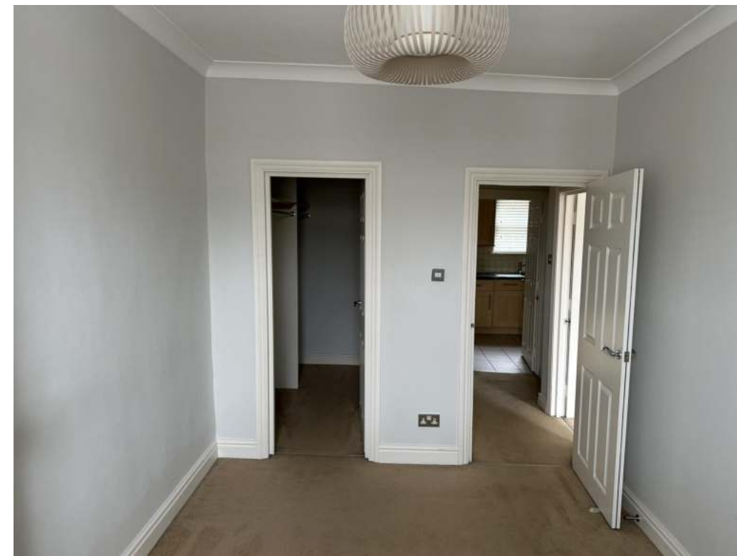
Bedroom - Elevation 3