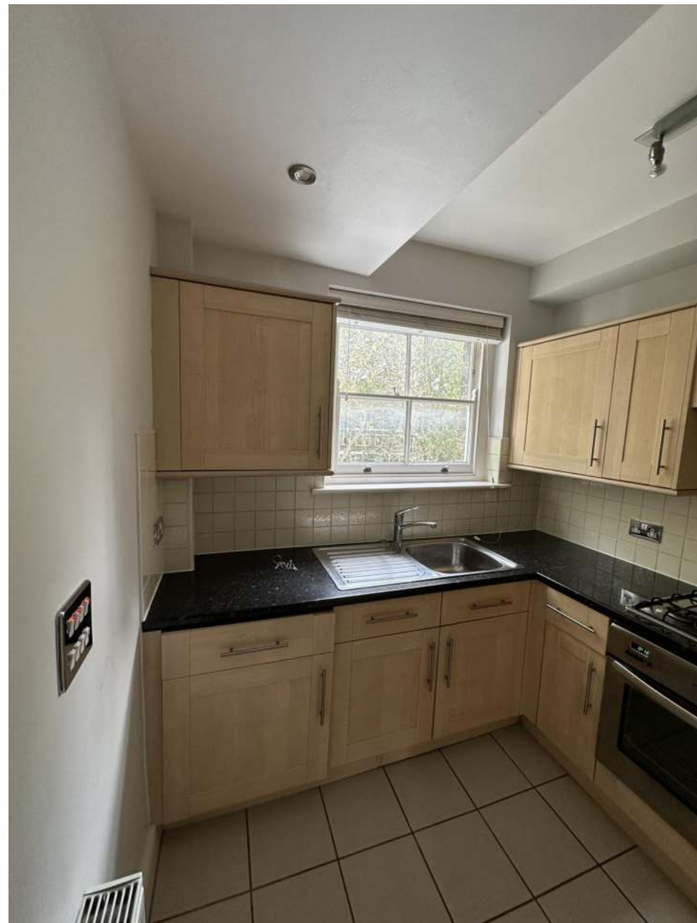
Kitchen - Elevation 1