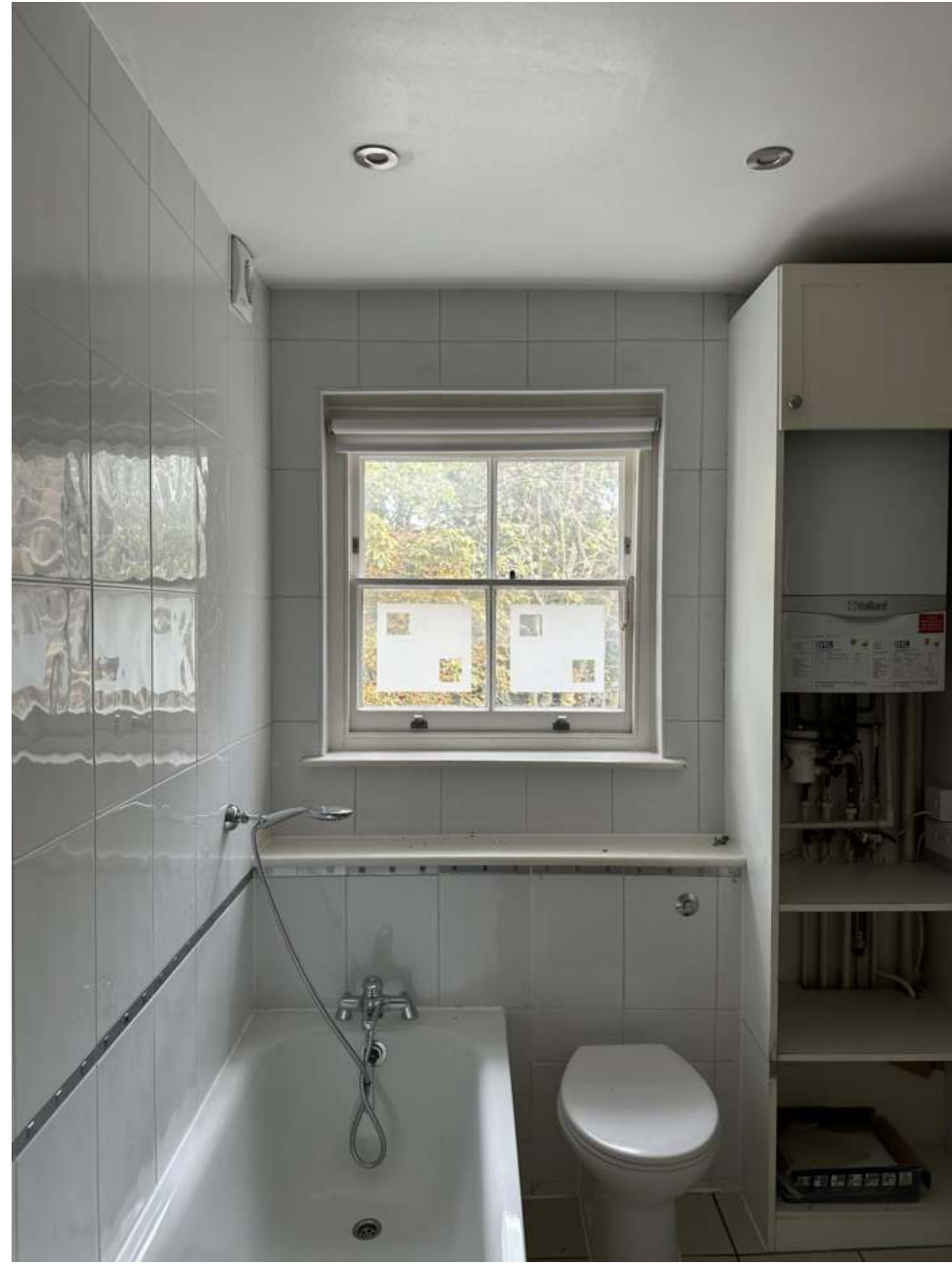
Bathroom - Elevation 1