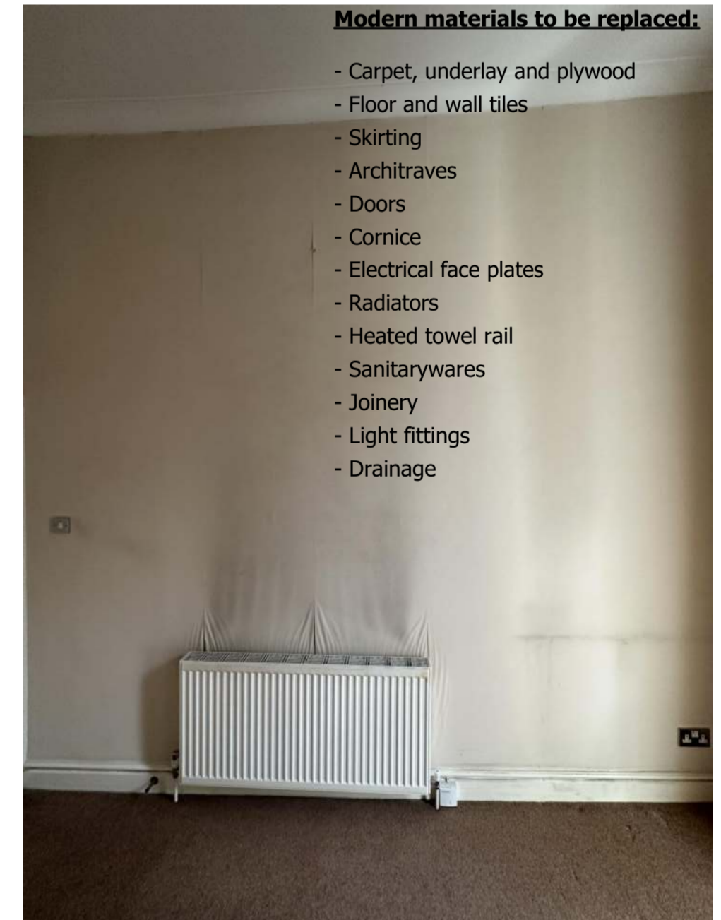
Bedroom - Elavation 4