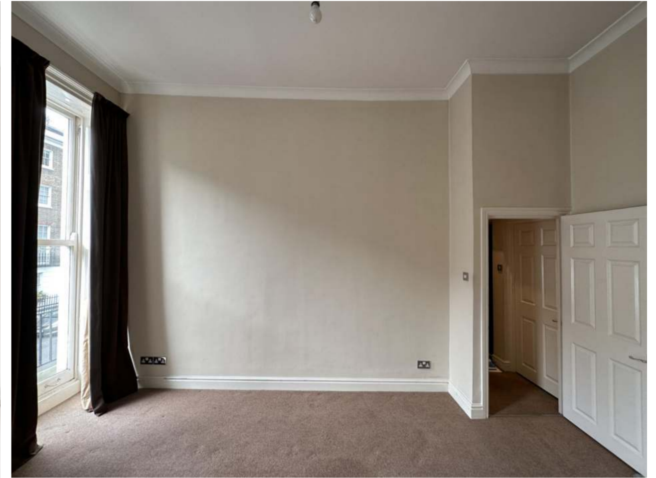
Reception Room - Elevation 4