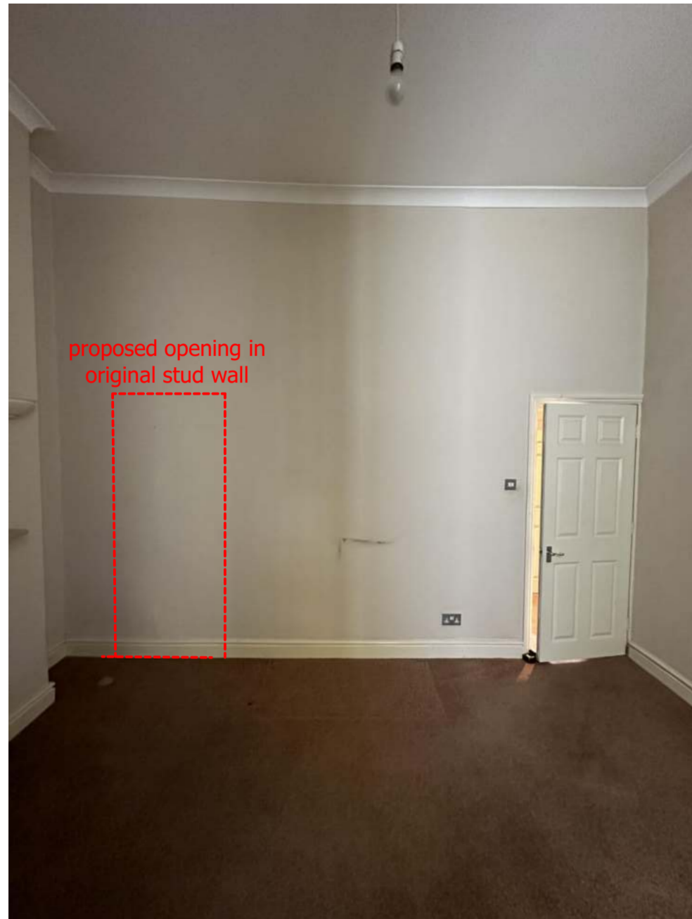
Dining - Elevation 1