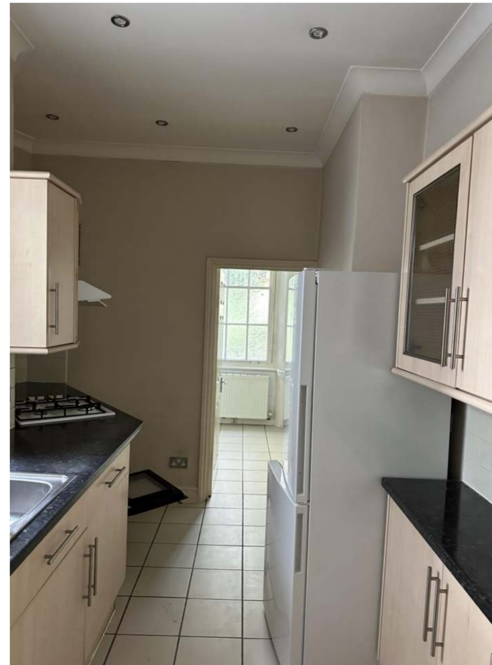
Kitchen - Elevation 2