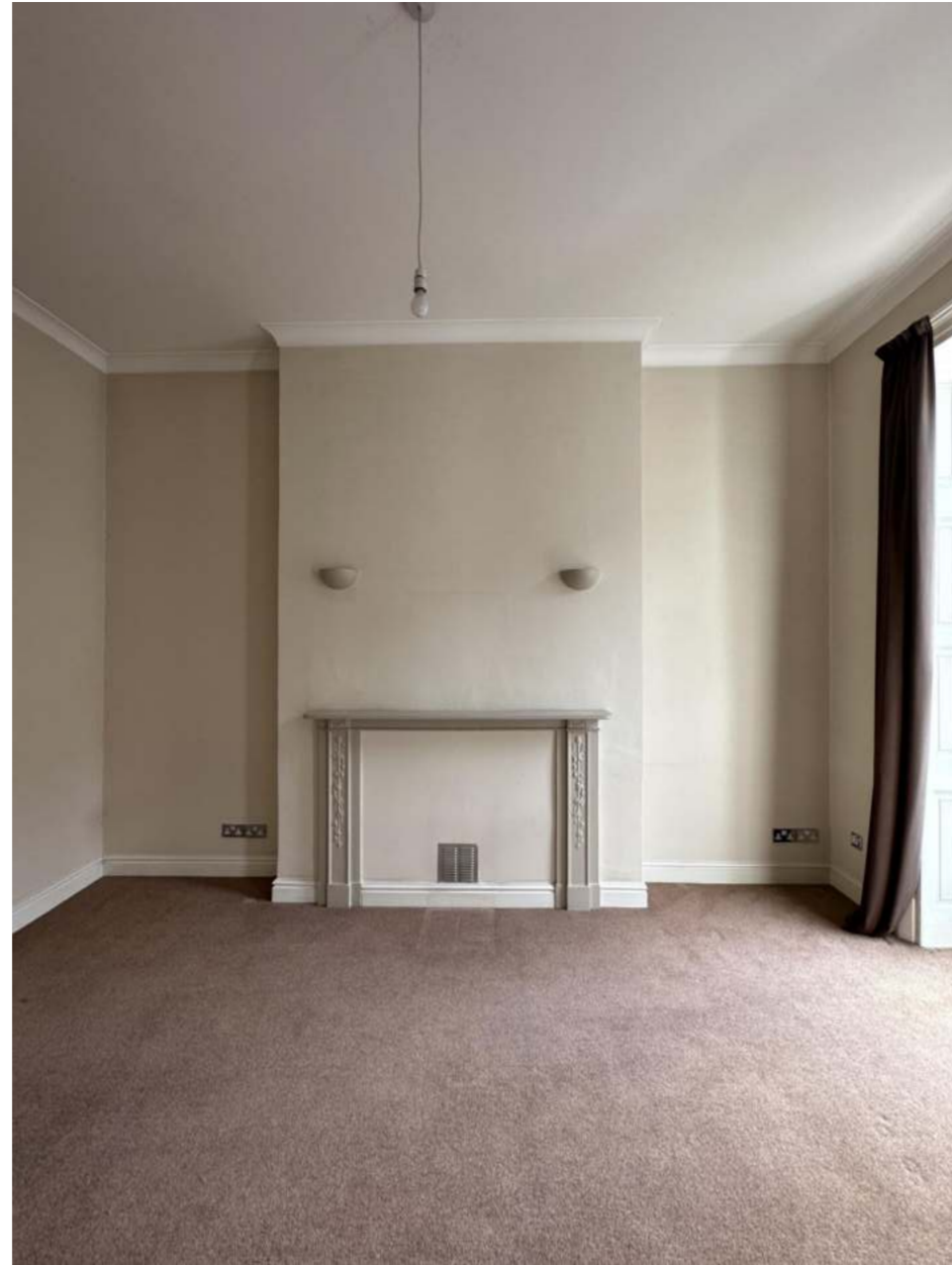
Reception Room - Elevation 2