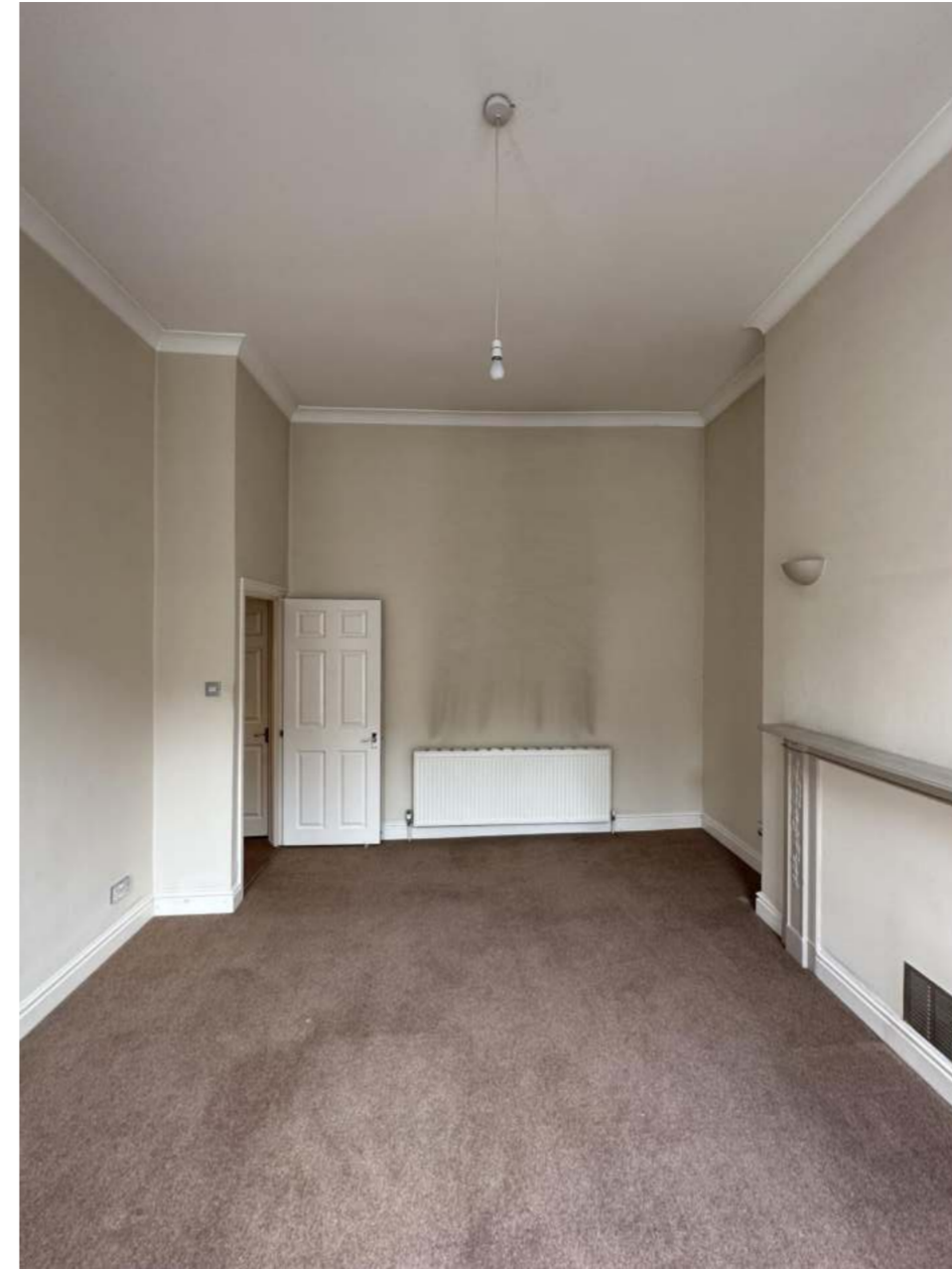
Reception Room - Elevation 3