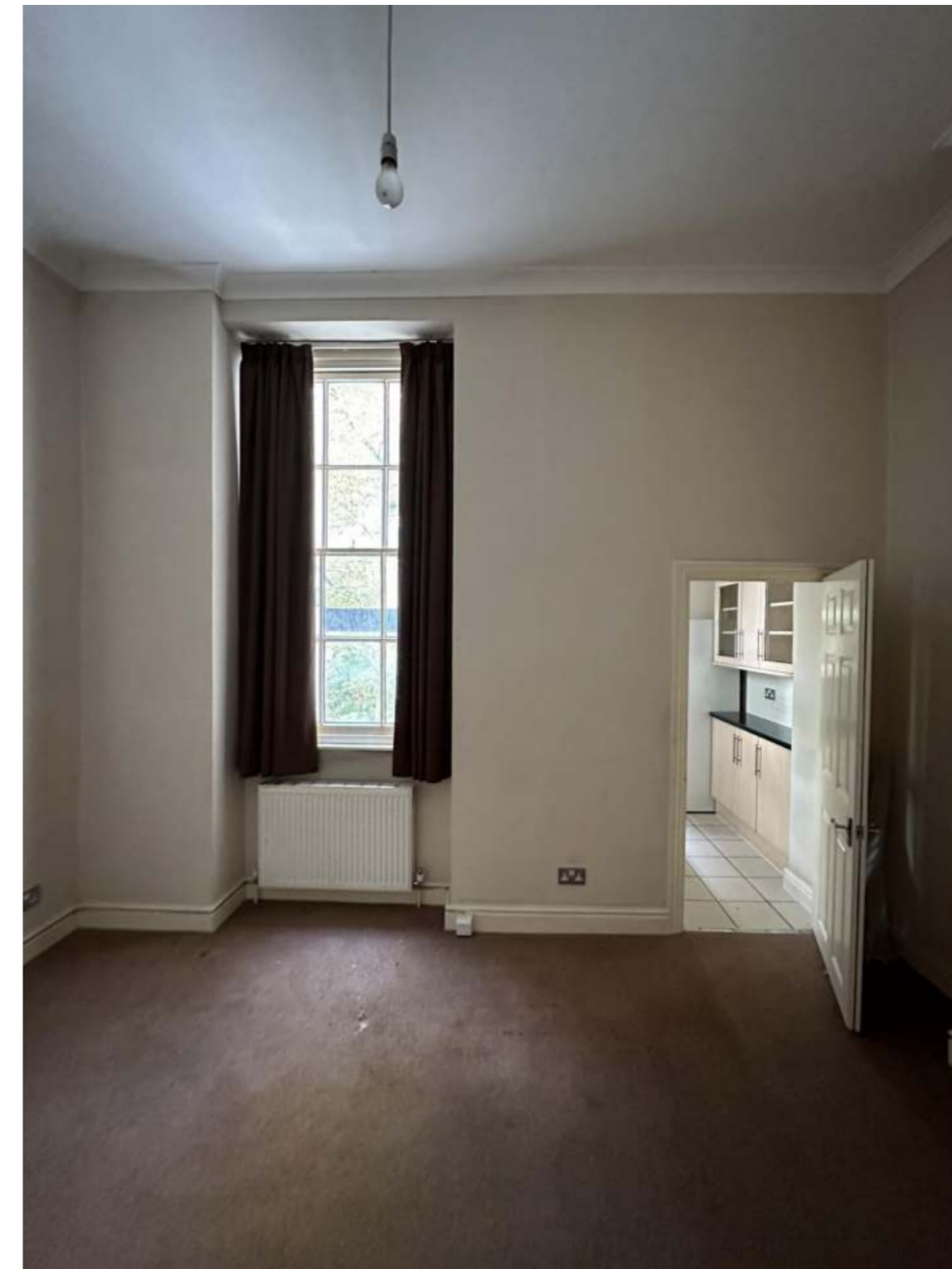
Dining - Elevation 3