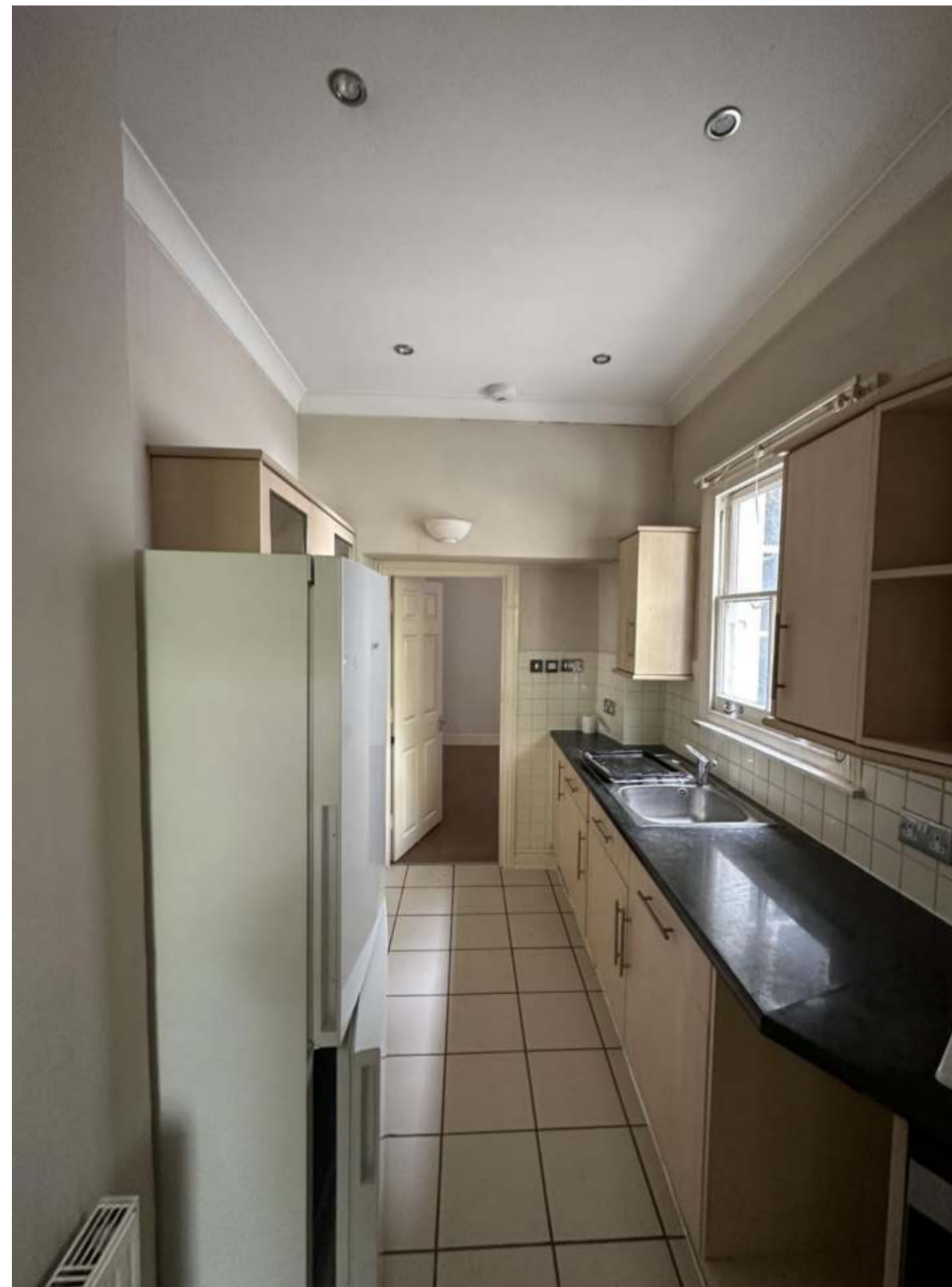
Kitchen - Elevation 1