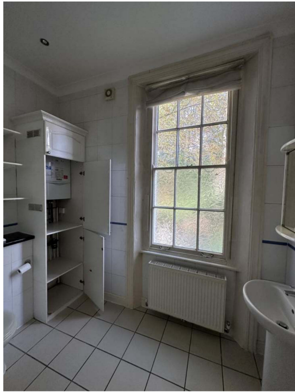
Bathroom - Elavation 1