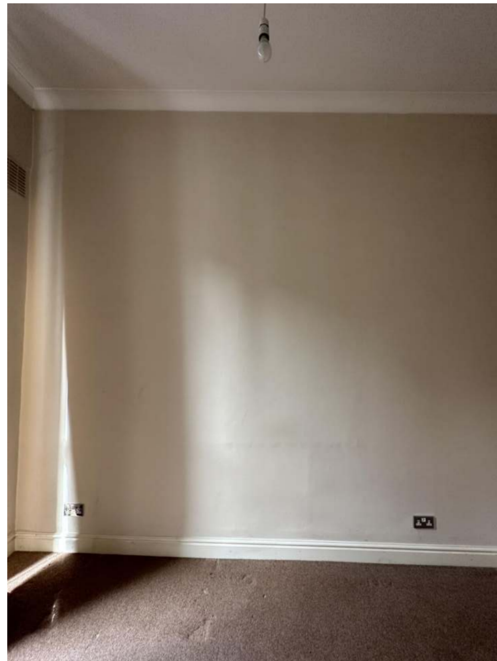
Bedroom - Elavation 2