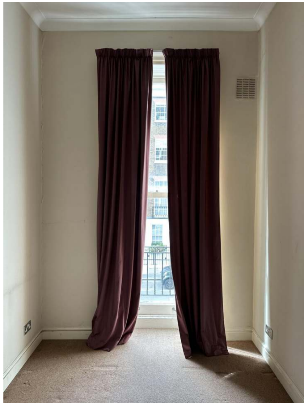
Bedroom - Elavation 1