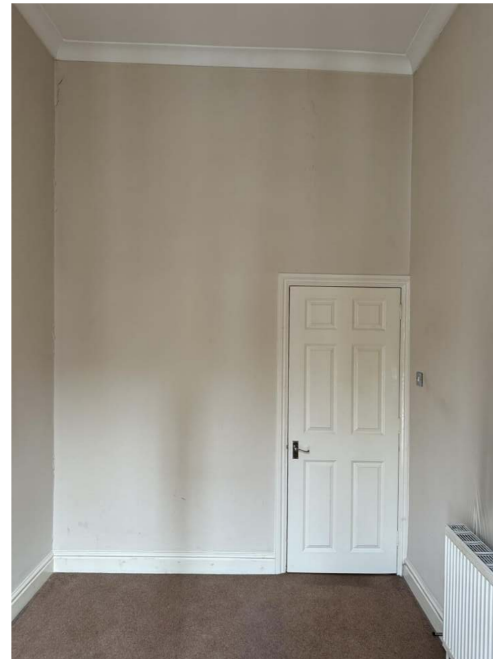
Bedroom - Elavation 3