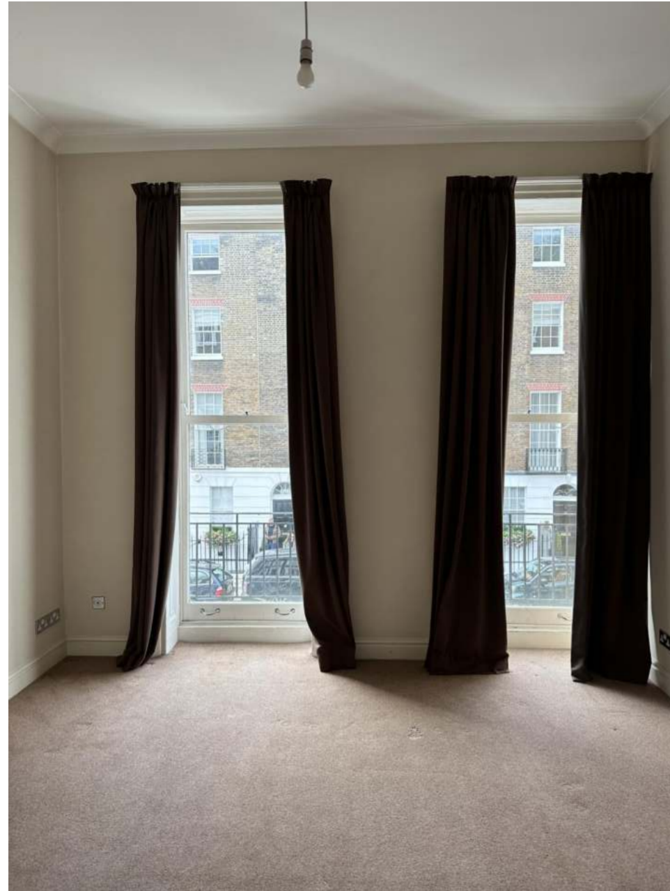
Reception Room - Elevation 1