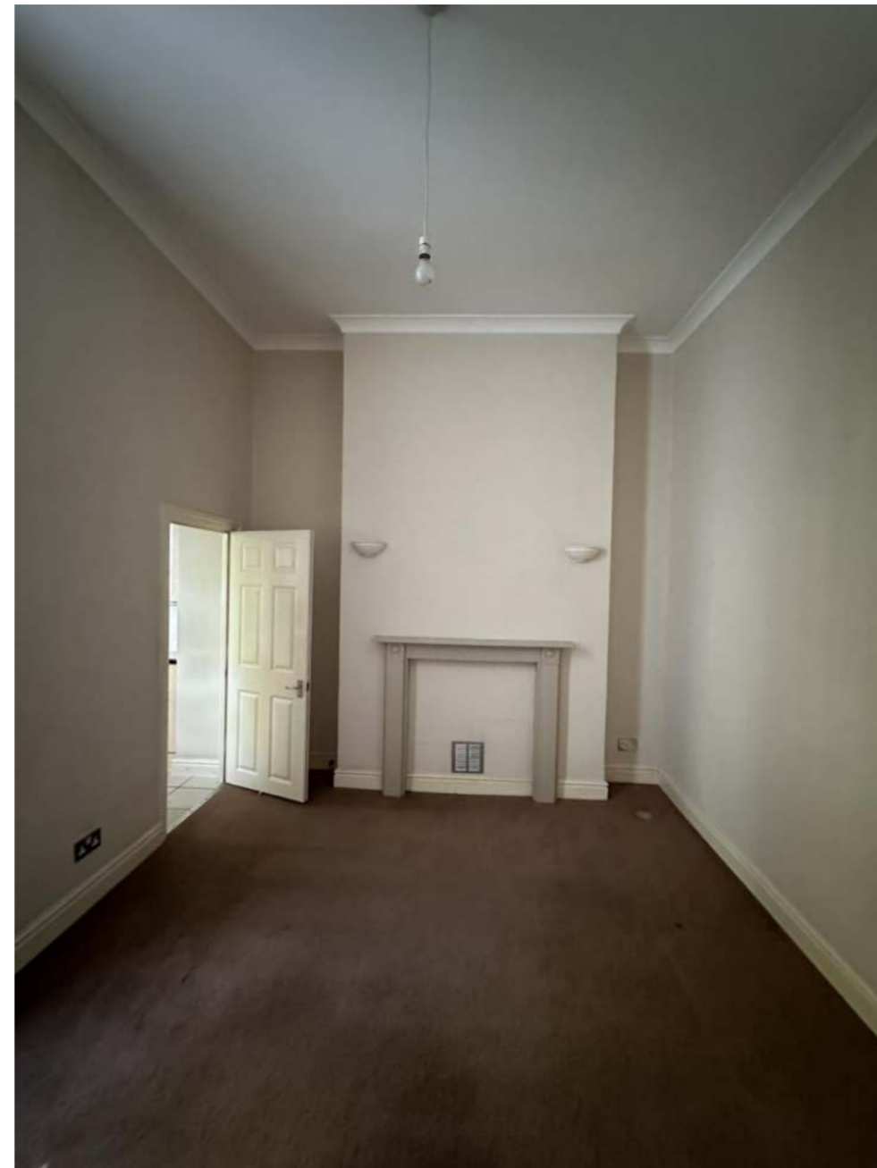
Dining - Elevation 2