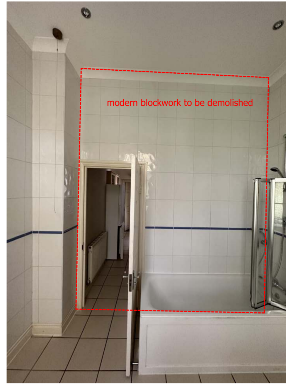
Bathroom - Elavation 3