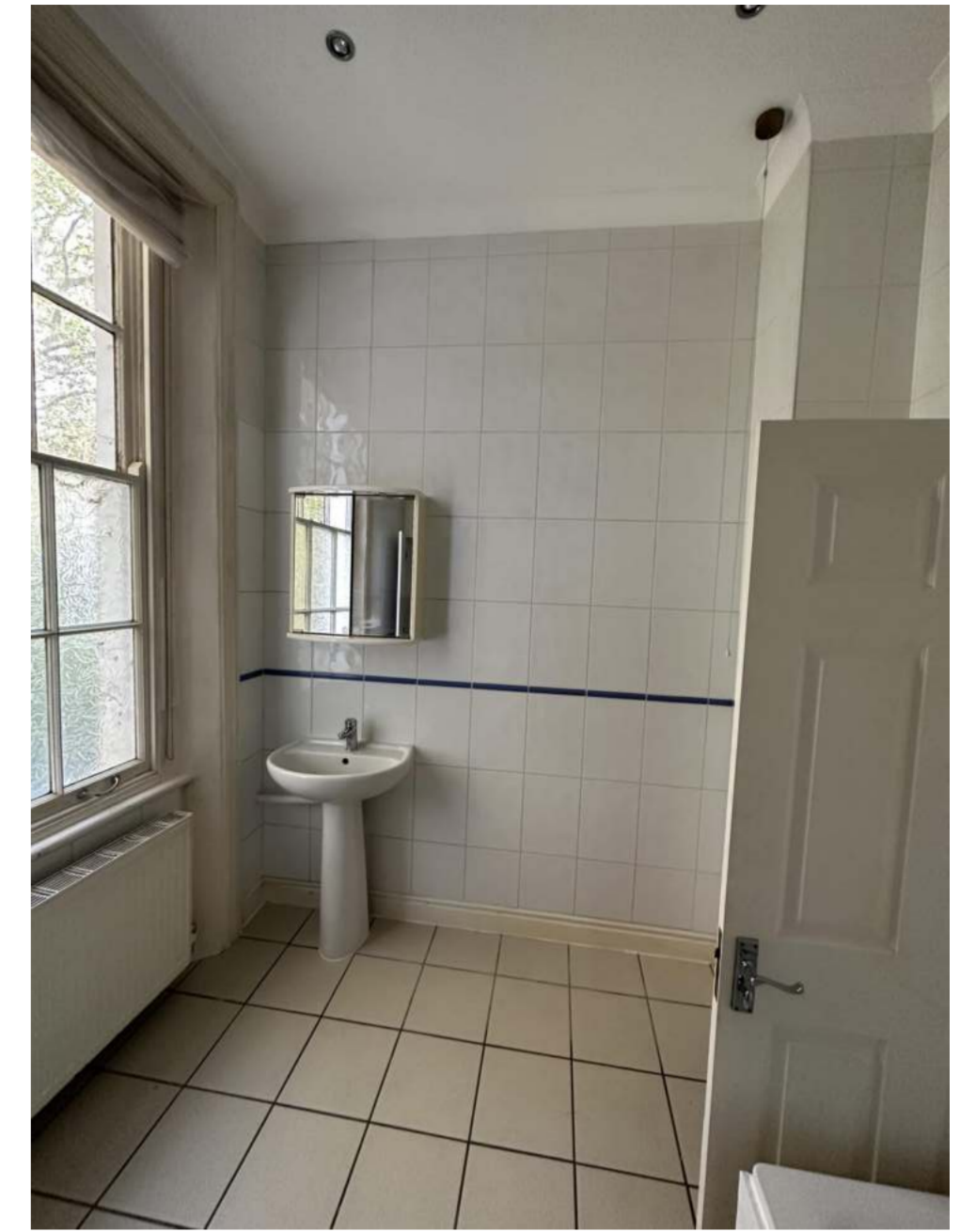
Bathroom - Elavation 4