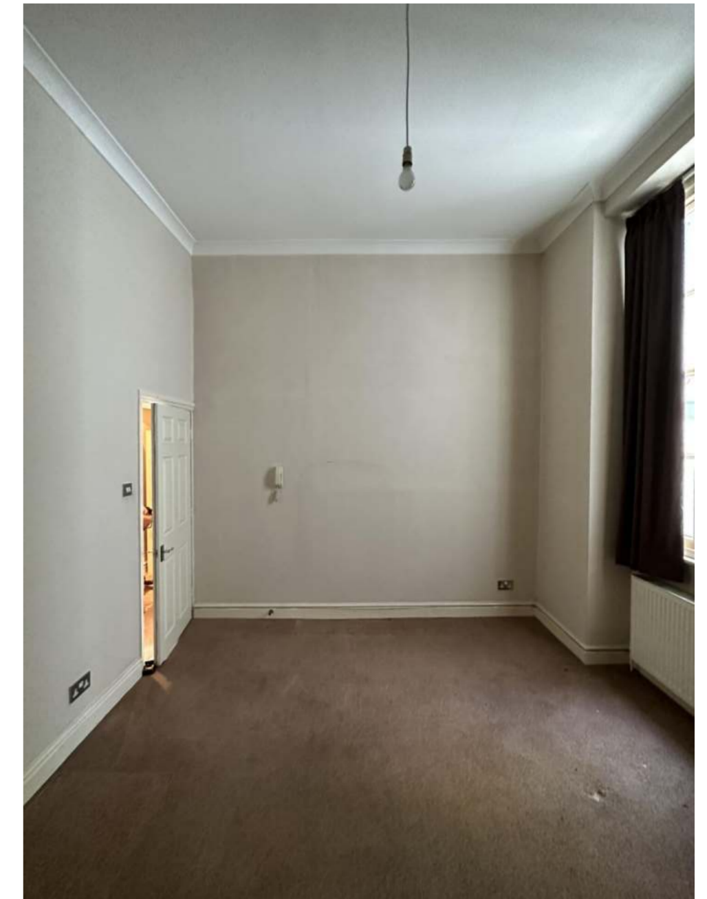
Dining - Elevation 4