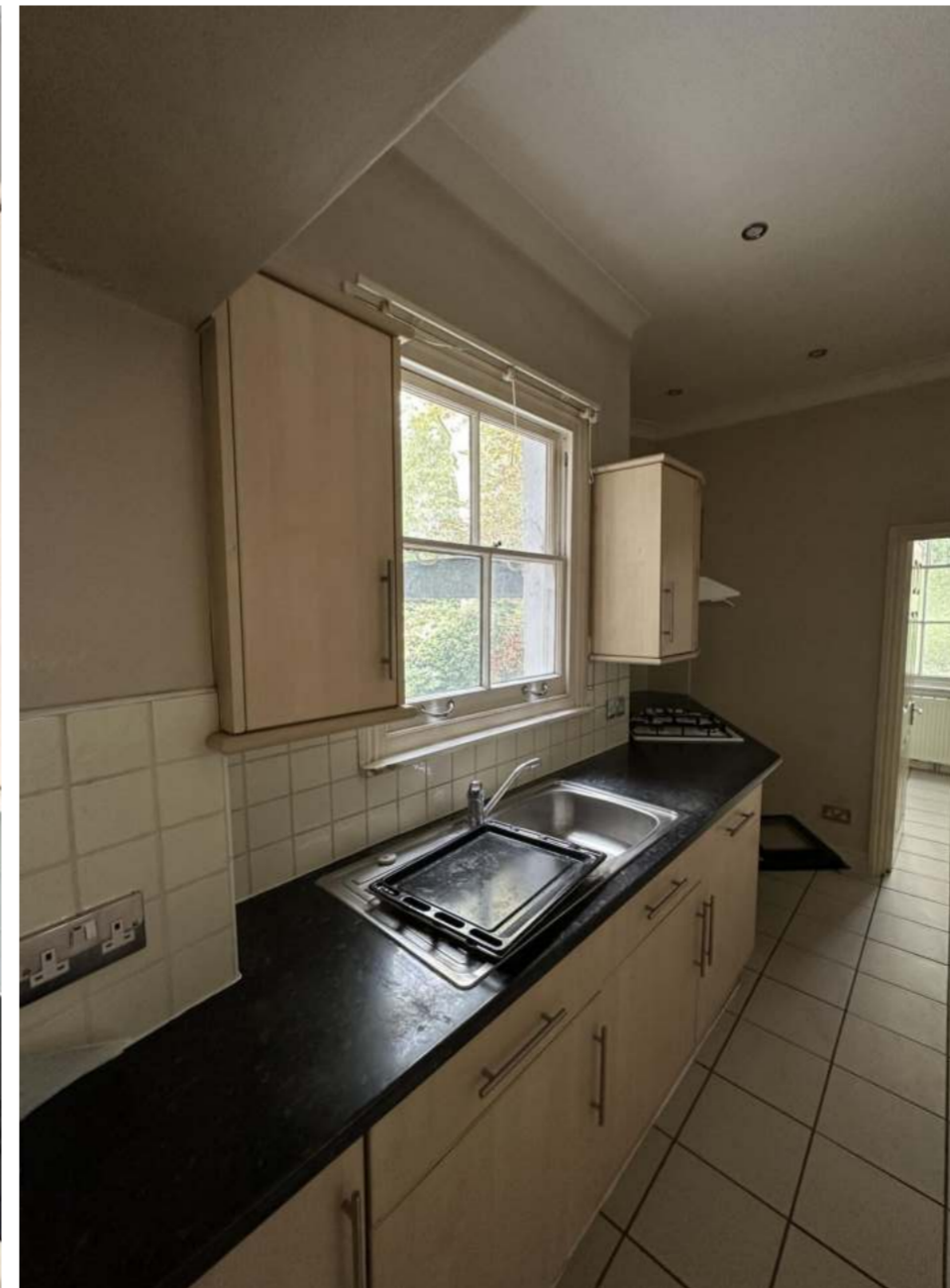
Kitchen - Elevation 3