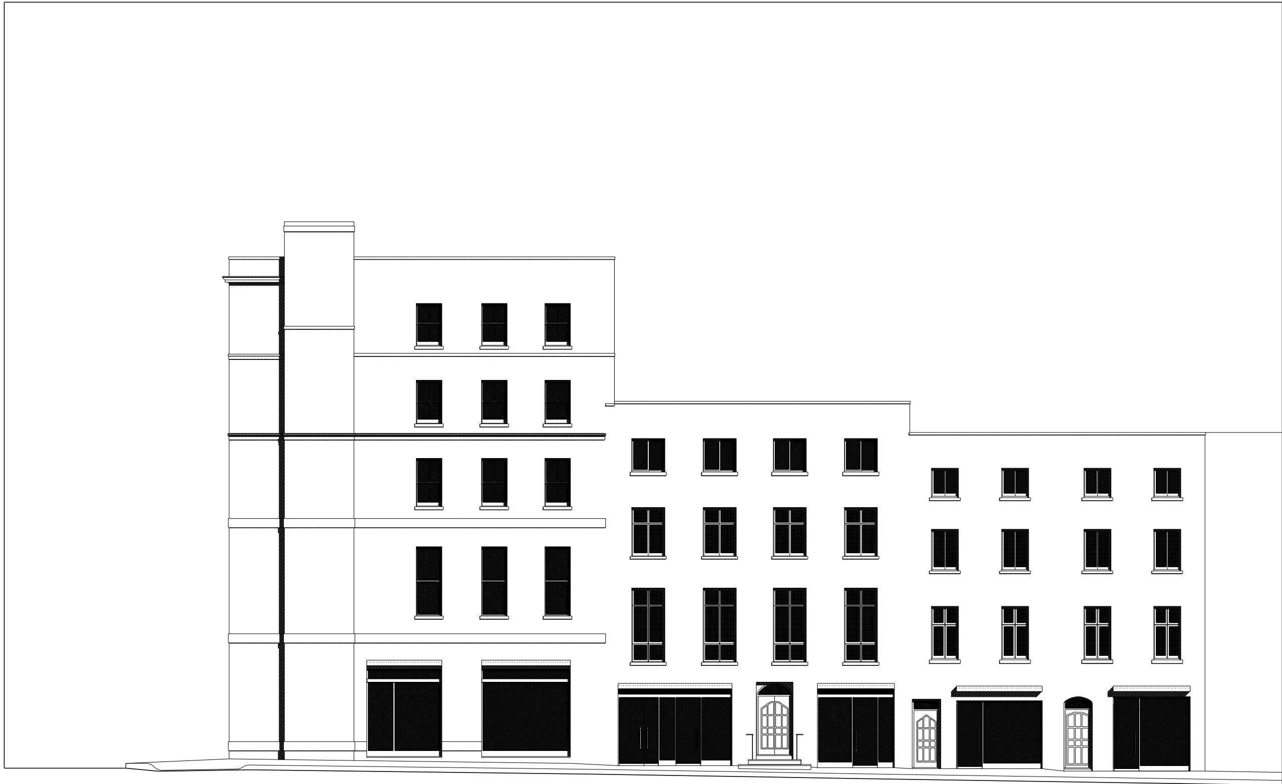
existing Thayer Street elevation (- with awning cassettes installed)