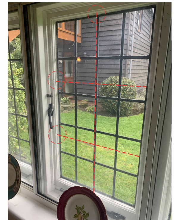
current secondary glazing

slimline double glazing to remove the need for any further secondary glazing