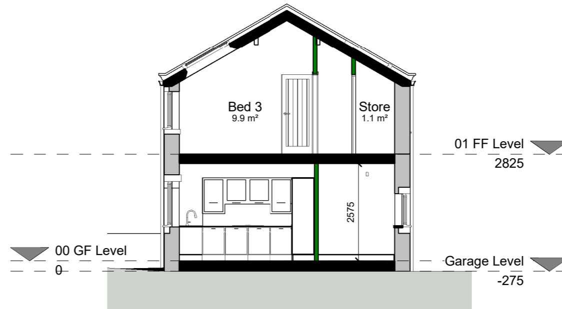
Section BB 1 : 100