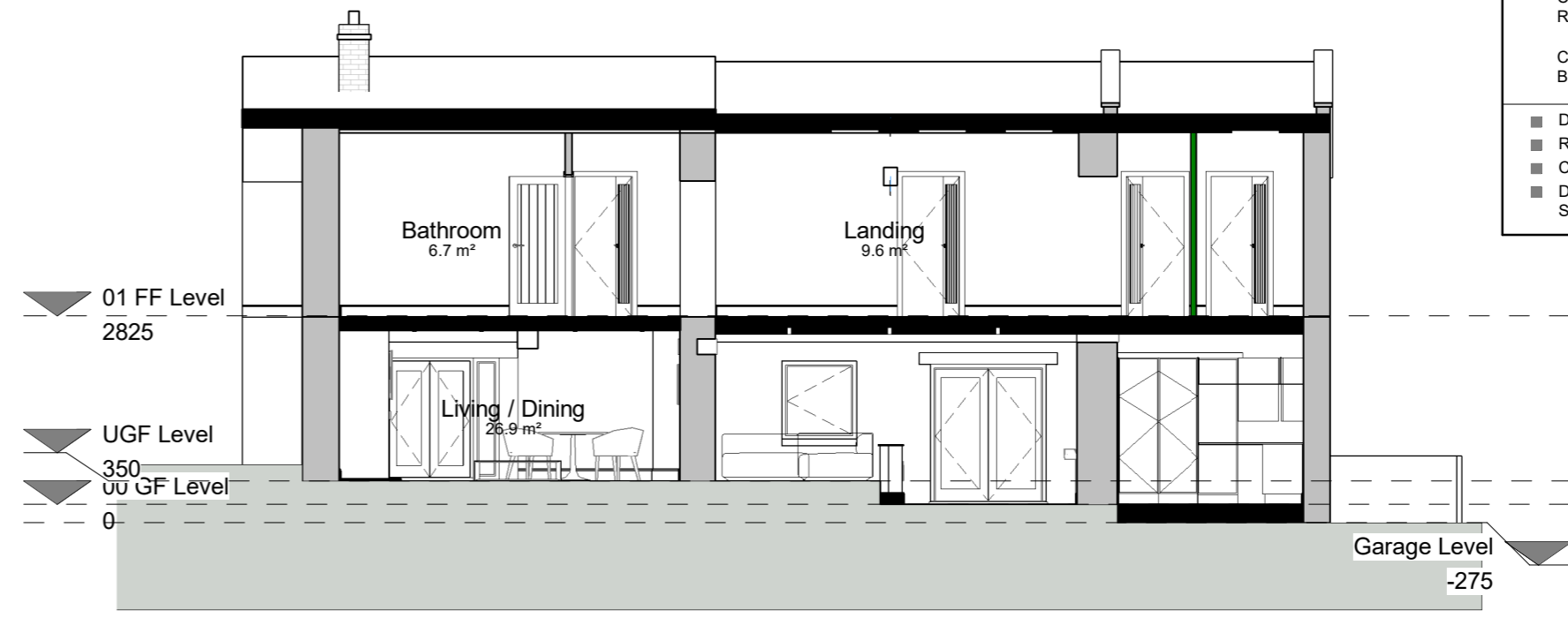
Section AA 1 : 100