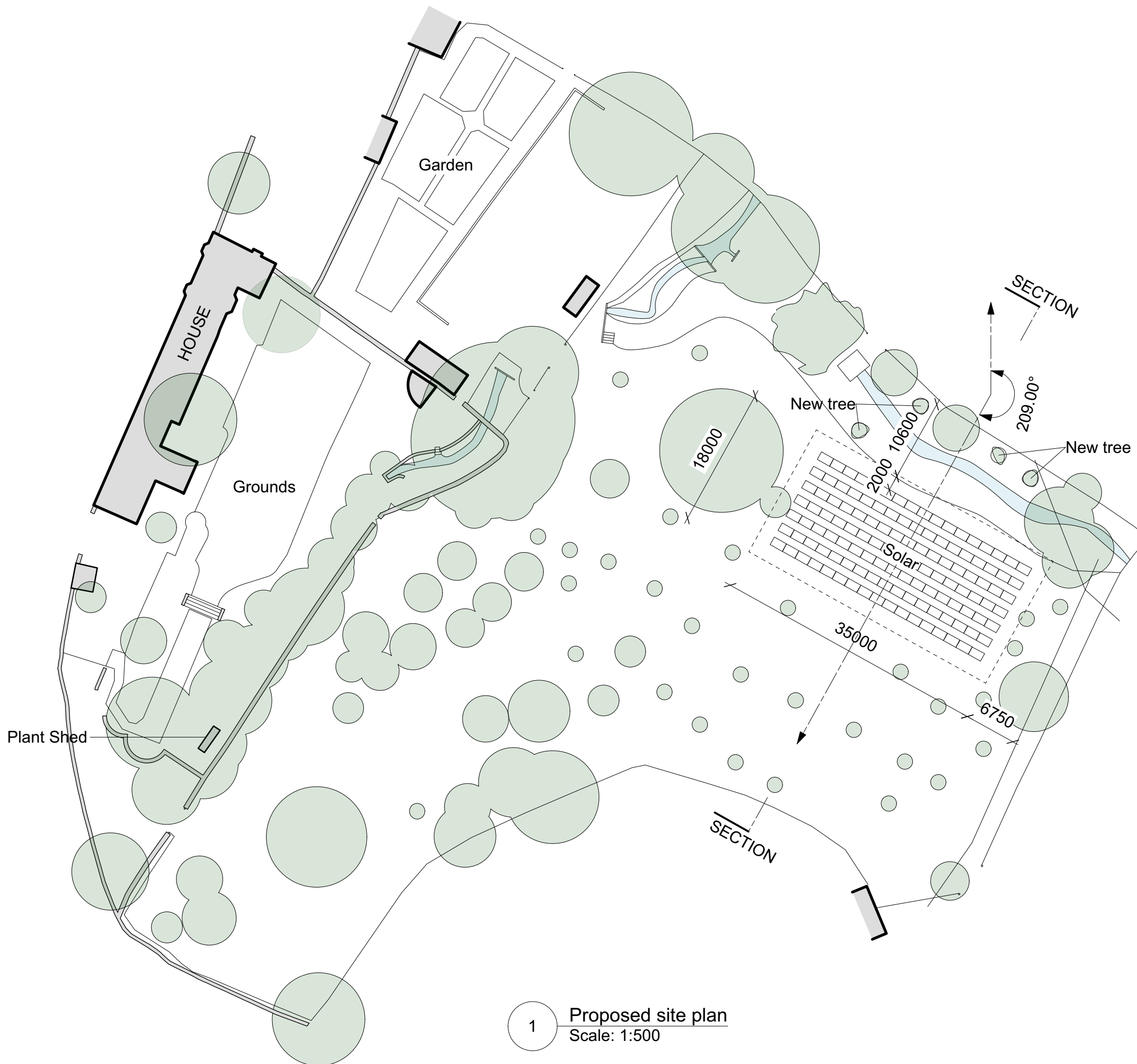
1 Proposed site plan Scale: 1:500

All levels and dimensions to be site surveyed and confirmed by the contractor. See also architectural details, mechanical and electrical intent layout and structural engineers drawings and specifications. Door and windows manufacturer to produce shop drawings for comment before manufacture. All details are intent only, to be finalised by the contractor. Drawings subject to statutory approvals.