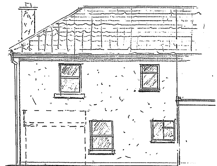
EXISTING REAR ELEVATION (NORTH)