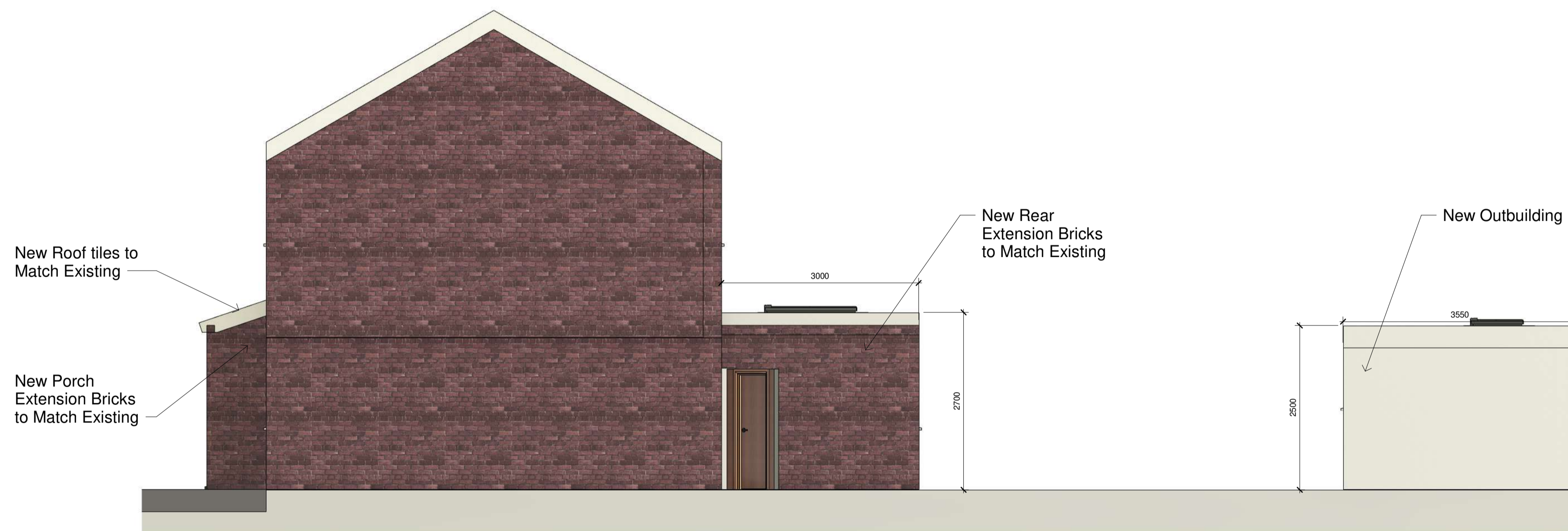
2 Side B - Proposed 1 : 50