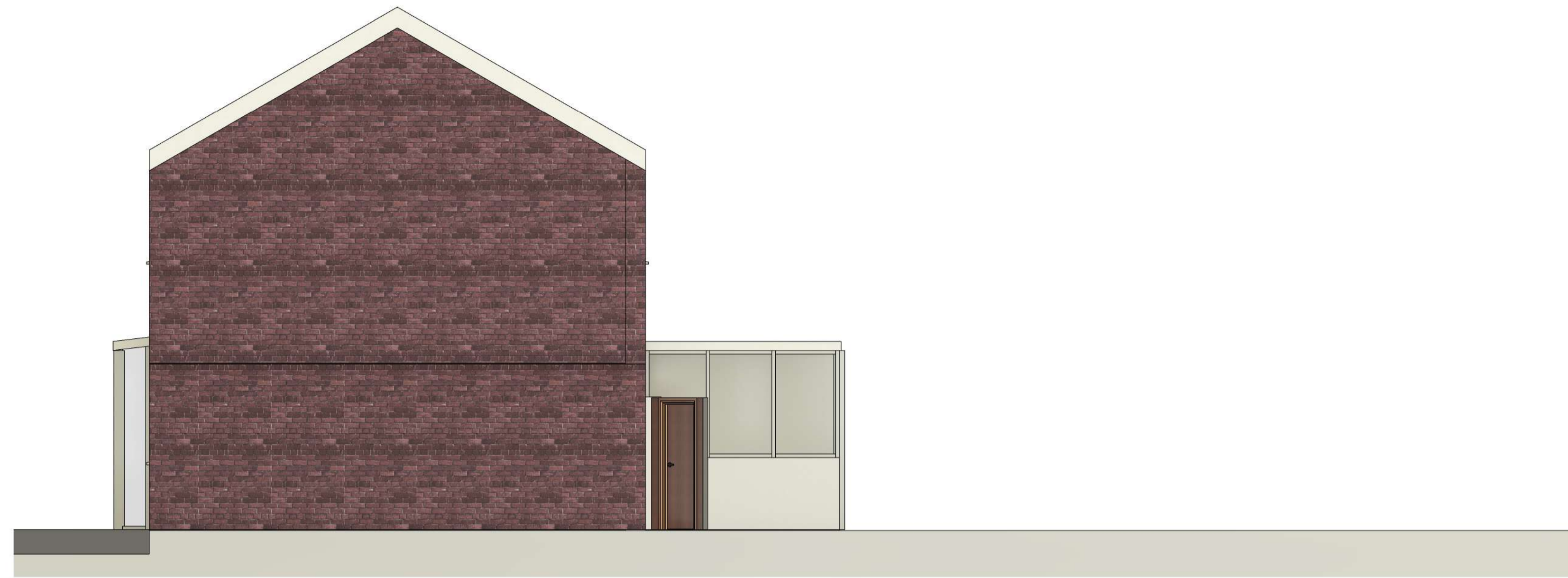
1 Side B - Existing 1 : 50