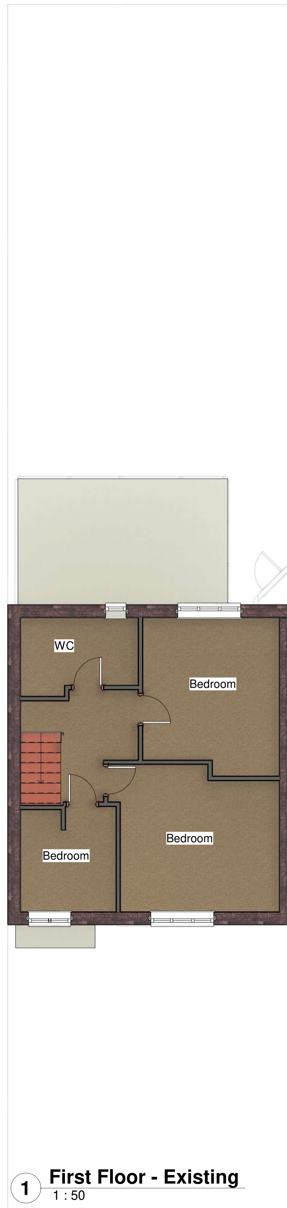
1 First Floor - Existing 1 : 50