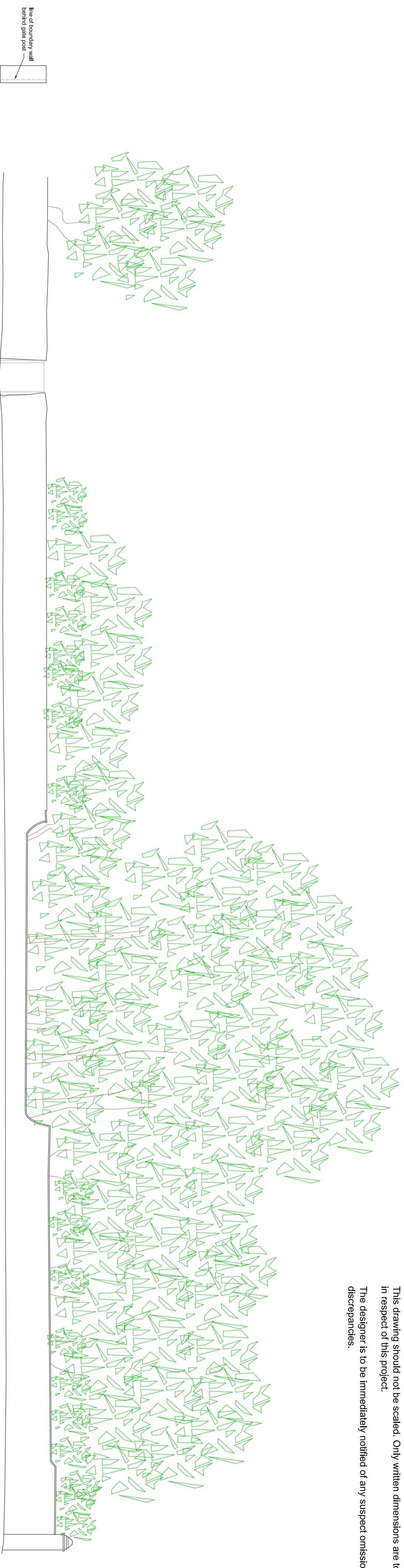
Existing Section to Boundary Wall at Pedestrian Entrance @ 1 : 100

The designer is to be immediately notified of any suspect omissions or discrepancies.