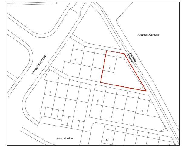
Site Location Plan Scale 1 : 1250