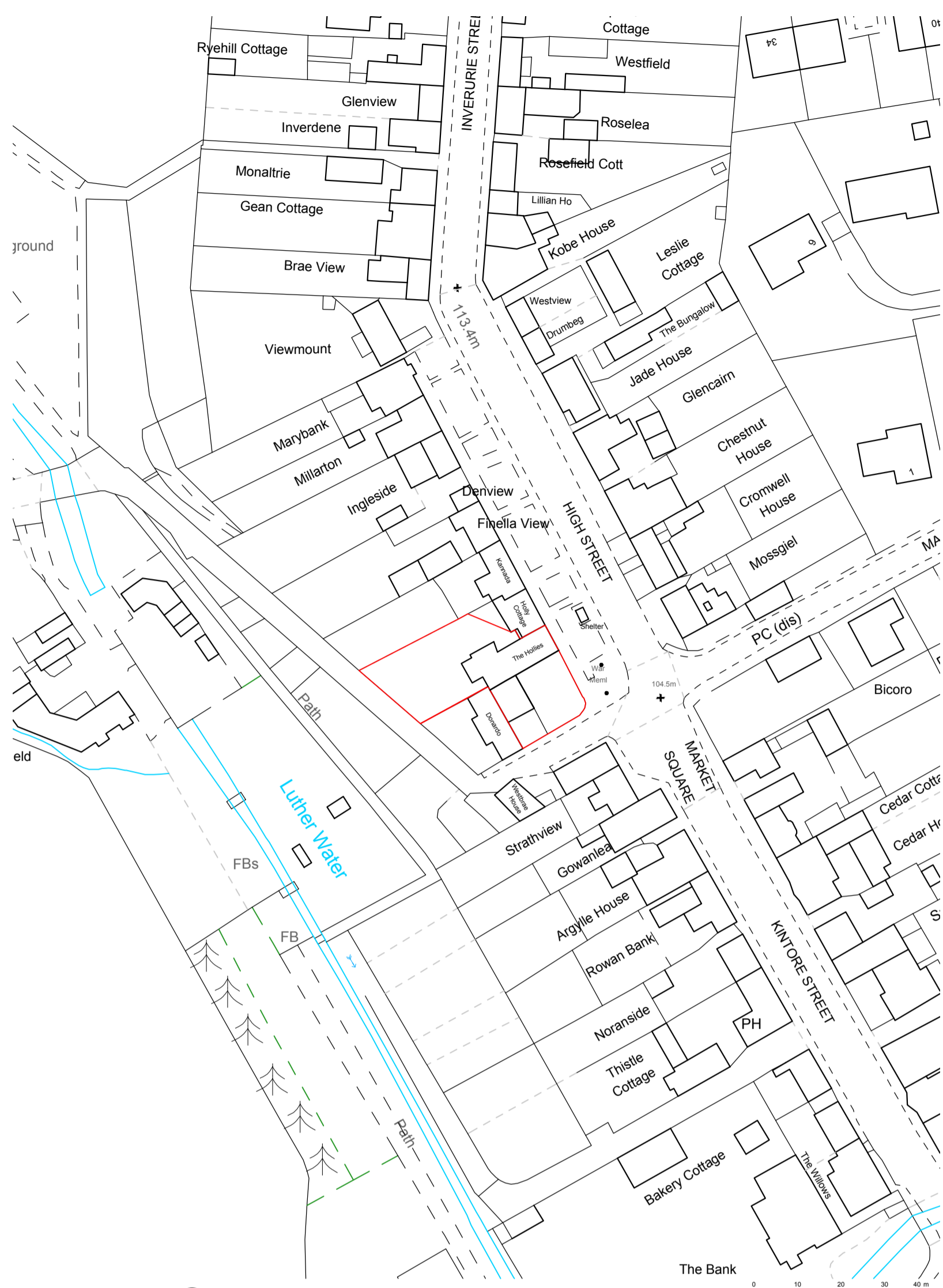
Location Plan 1:1000