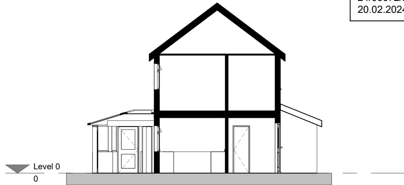
1 Existing - Section 1 : 100

www.themarketdesignbuild.com info@themarketdesignbuild.com