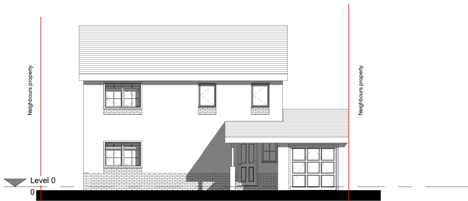
2 front elevation - Proposed 1 : 100