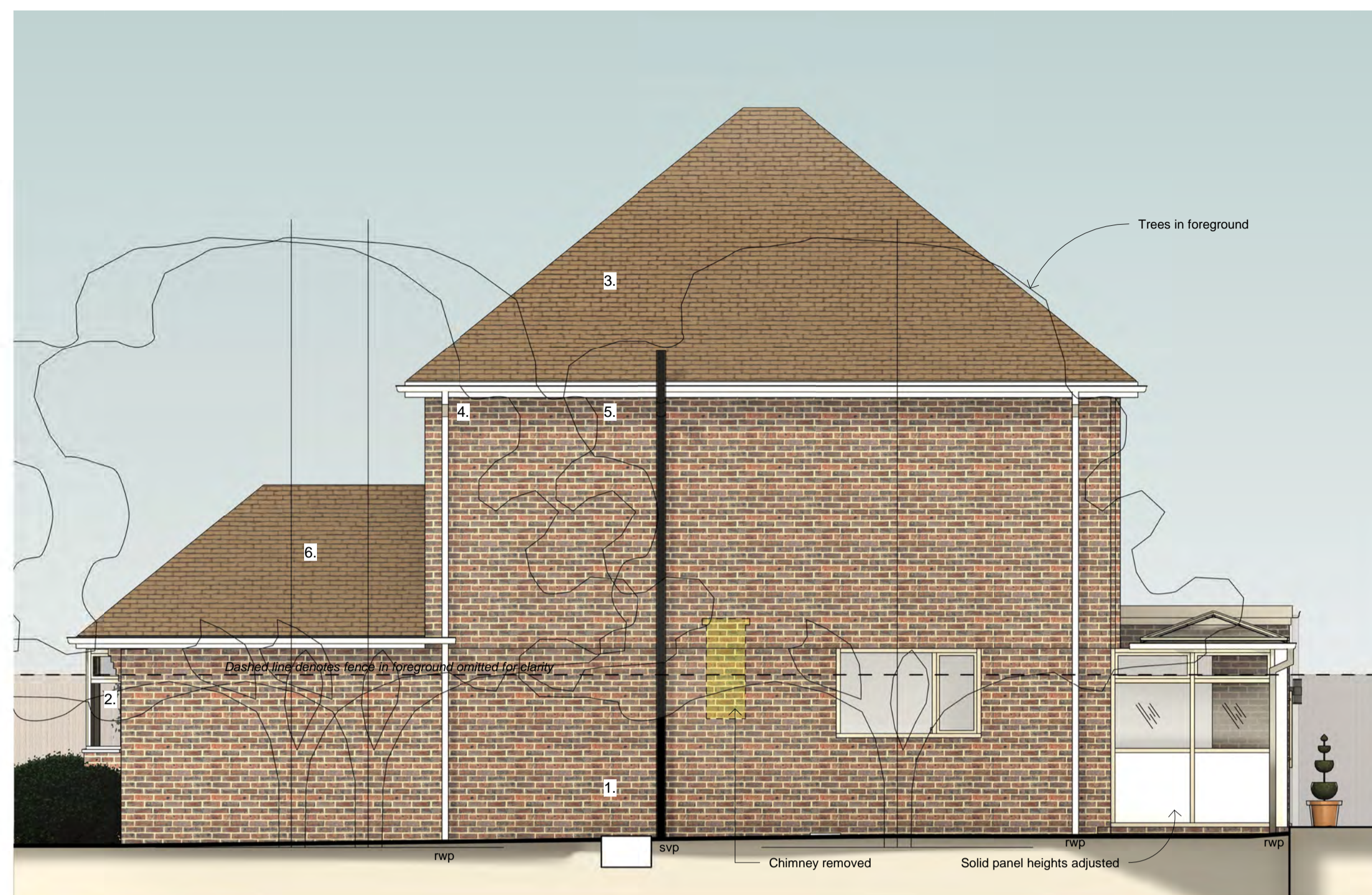
Side Elevation (Right) 1 : 50