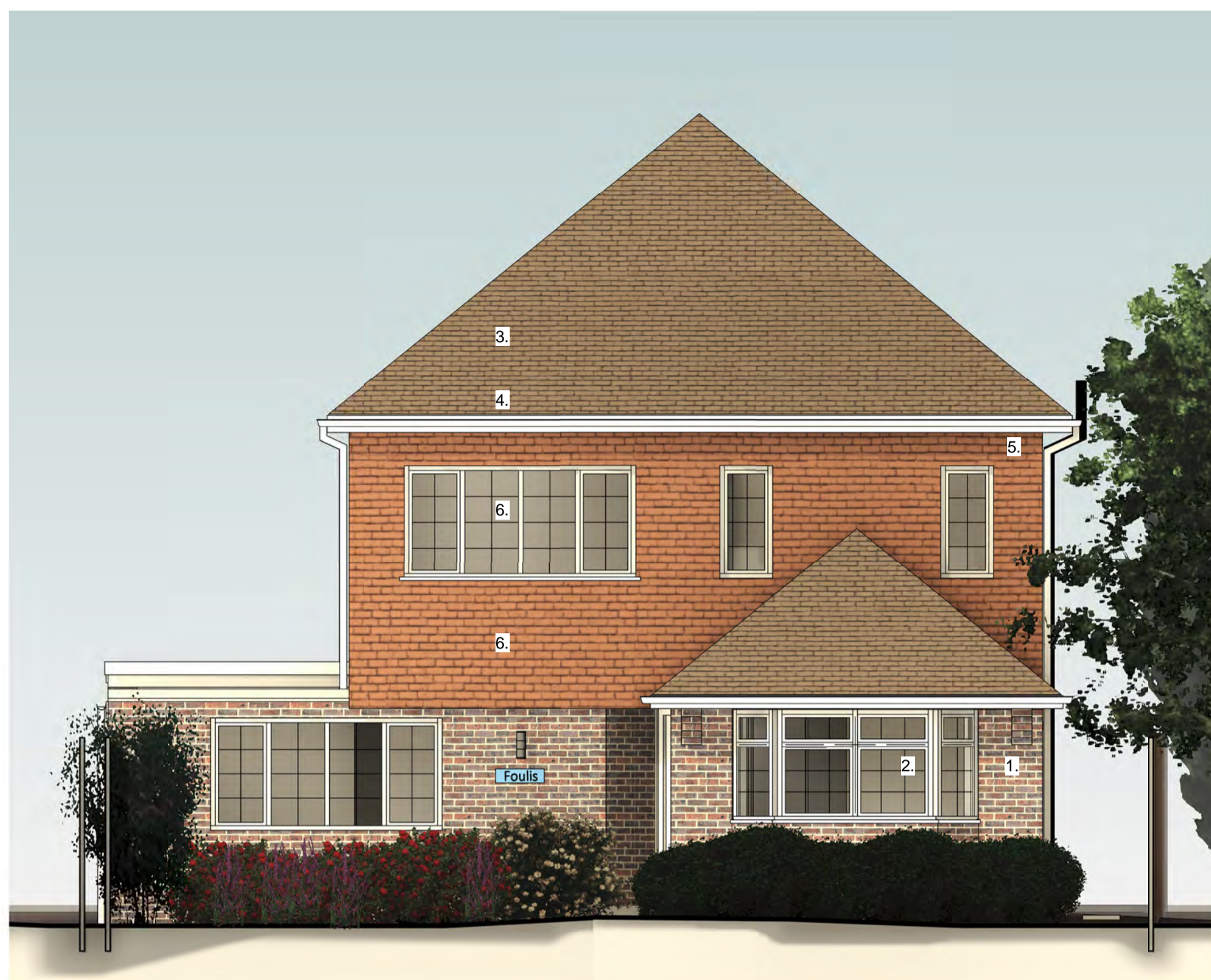
Front Elevation 1 : 50