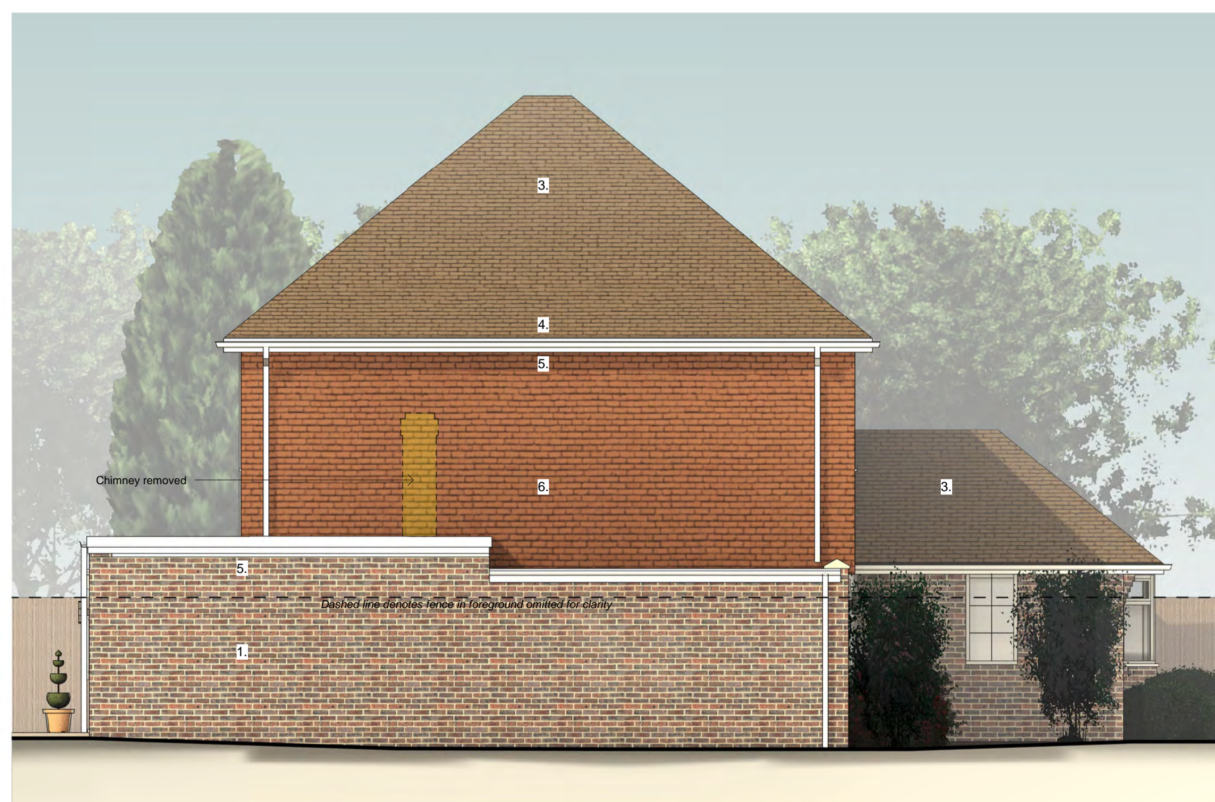
Side Elevation (Left) 1 : 50