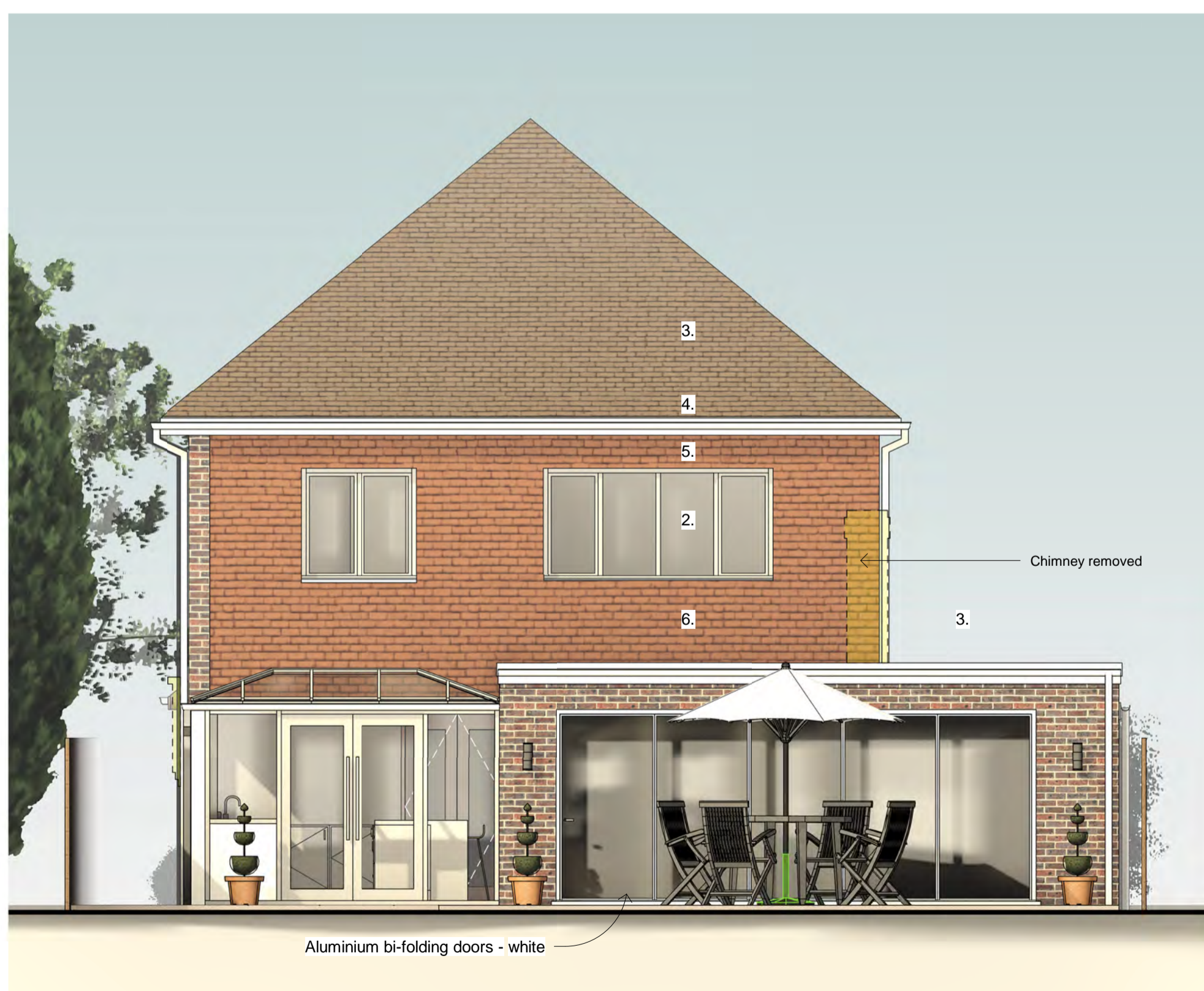
Rear Elevation 1 : 50